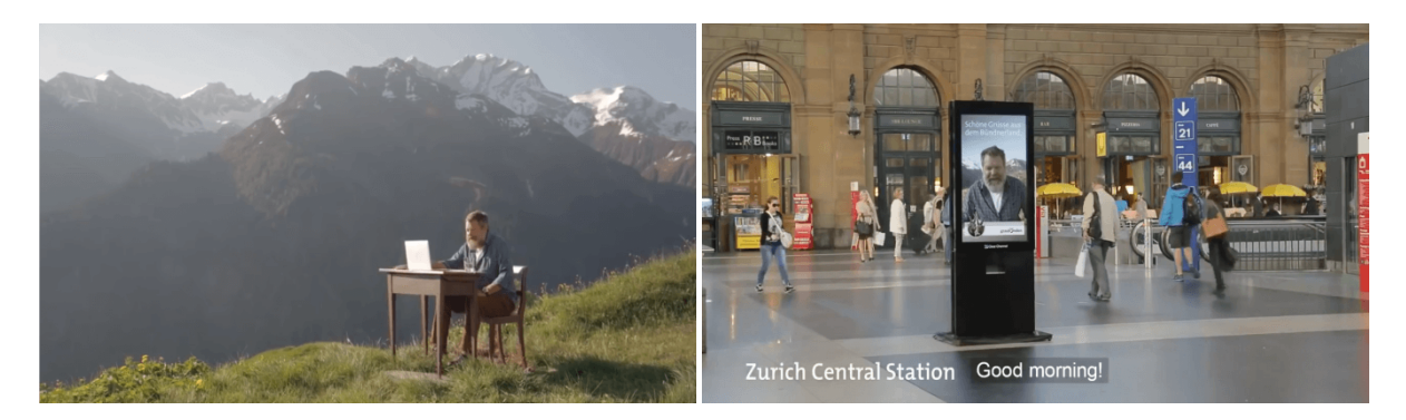
Figure 1: Screenshots of video commercial Switzerland, 2015 [online]

We are exhibiting below some relevant captures of this situation of a double-layered (non)place virtualization: