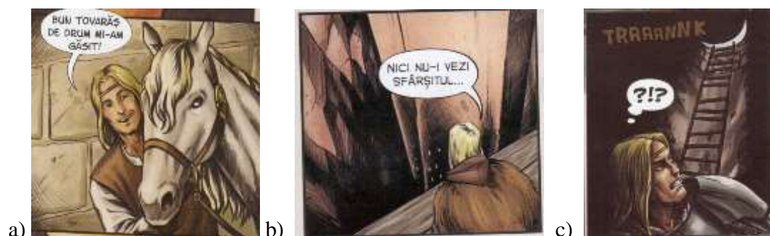
Fig. 9. a) Eye-level perspective b) Over-head perspective c) Ground-level perspective ( Harap Alb Continuă – Album)

In addition, there are used different perspectives to manipulate the reader's orientation and to produce various emotional states, influenced by his position as a spectator: the eye-level perspective to reinforce realism, whose purpose is to inform the reader; the over-head perspective, which provides a clear view of the settings, the reader acting as an observer; the ground-level perspective, which involves the reader in the impact of the action, inducing a sense of smallness and fear (see fig. 9). The same way function narrow panels, suggesting imprisonment, while wide panels make space, provide escape.