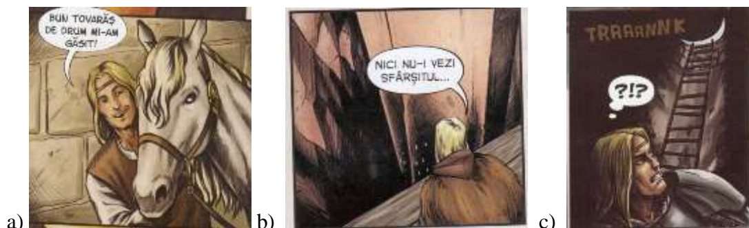
Fig. 9. a) Eye-level perspective b) Over-head perspective c) Ground-level perspective ( Harap Alb Continuă – Album)

In addition, there are used different perspectives to manipulate the reader's orientation and to produce various emotional states, influenced by his position as a spectator: the eye-level perspective to reinforce realism, whose purpose is to inform the reader; the over-head perspective, which provides a clear view of the settings, the reader acting as an observer; the ground-level perspective, which involves the reader in the impact of the action, inducing a sense of smallness and fear (see fig. 9). The same way function narrow panels, suggesting imprisonment, while wide panels make space, provide escape.