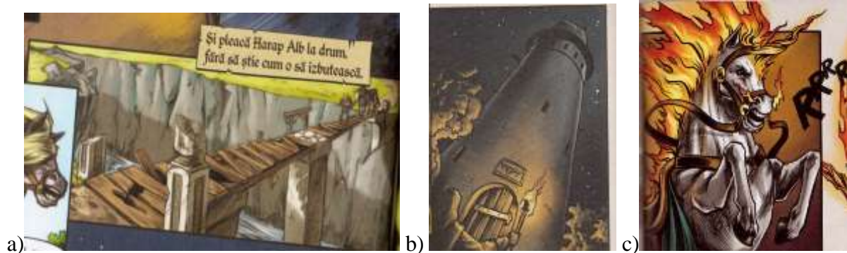
Fig. 3. a) Long panel b) High panel c) Exceeded panel ( Harap Alb Continuă – Album)

A high panel reinforces the illusion of height as well as a long one the length, while a character bursting out of the confines of the panel, an inviolable device in the comics, highlights unleashed power (see fig. 3).