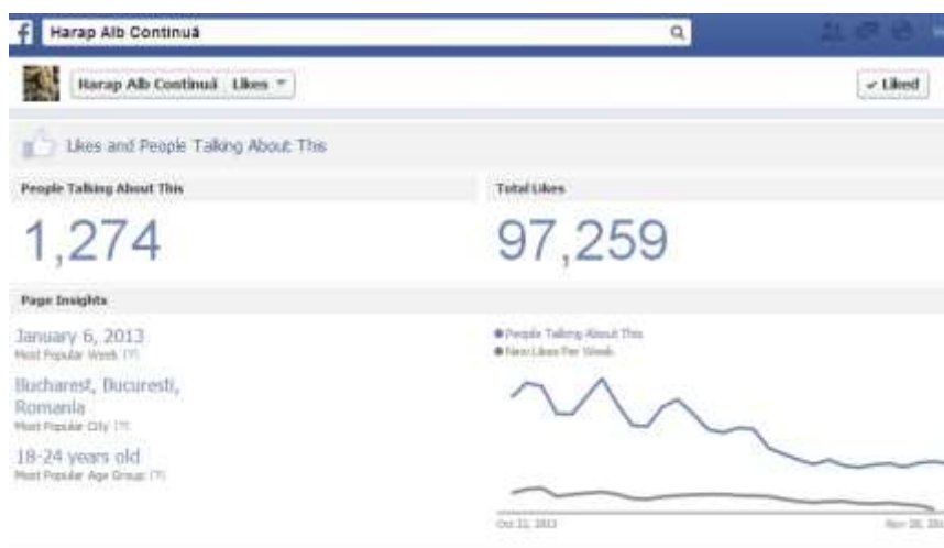
Fig. 10. The impact of The White Moor Continues comics on Facebook ( https://www.facebook.com/revistaharapalbcontinua/likes )

If we relate this assertion to the pedagogical dimension, it can be stated that the interest in comics could be exploited within literature classes in schools, of course only as an alternative educational resource. In addition, as The White Moor fairy tale is found as an obligatory literary work at the high school level in Romania, as well as in the Baccalaureate syllabus, therefore the understanding of classics through as many media is welcome and not to be neglected. Given that in America and Western Europe, comics are nowadays already regarded as an alternative method of learning, in the process of or even already introduced as part of the curriculum at all levels of education, there is no reason to diminish or exclude this possibility in the Romanian educational system, too.