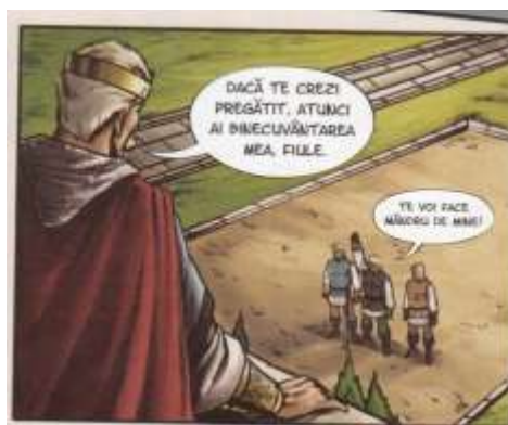
Fig. 2. Use of different font size to emphasize distance ( Harap Alb Continuă – Album )

There are panels which lack speech balloons, especially during action scenes, where speed forces the reader to supply the dialogue. Also, the shape of the panel frame or its absence is used not only as a stage for the action, but as a mean of involving the reader in the narrative, emphasizing the sensory dimension.