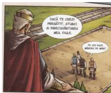
Fig. 2. Use of different font size to emphasize distance ( Harap Alb Continuă – Album)

There are panels which lack speech balloons, especially during action scenes, where speed forces the reader to supply the dialogue. Also, the shape of the panel frame or its absence is used not only as a stage for the action, but as a mean of involving the reader in the narrative, emphasizing the sensory dimension.