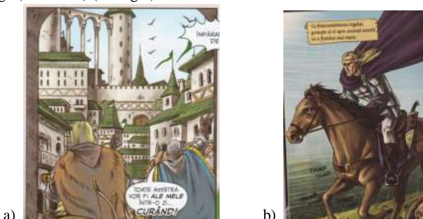
Fig. 7. a) Colours symbolism b) Speed stream as a narrative device ( Harap Alb Continuă – Album)

Also, the colours used in rendering the specificity of various kingdoms along with their inhabitants (green, red), the middle son's waving cloak during his rushed horseback riding in the speed stream, they all are narrative devices and are part of the adaptation's visual language (Eisner 25) (see fig.7).