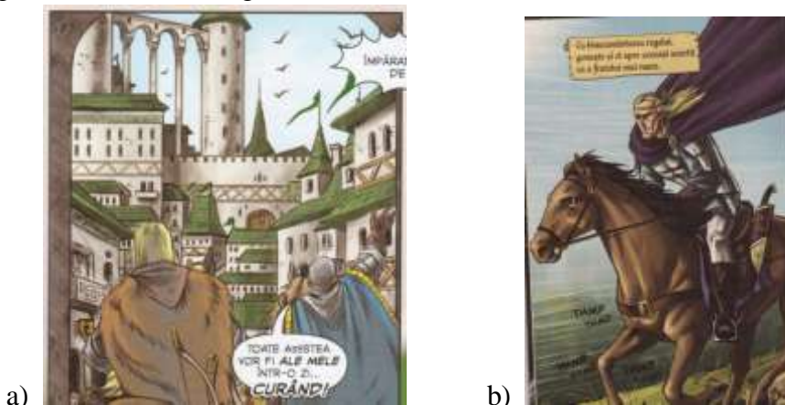
Fig. 7. a) Colours symbolism b) Speed stream as a narrative device ( Harap Alb Continuă – Album )

Also, the colours used in rendering the specificity of various kingdoms along with their inhabitants (green, red), the middle son's waving cloak during his rushed horseback riding in the speed stream, they all are narrative devices and are part of the adaptation's visual language (Eisner 25) (see fig.7).