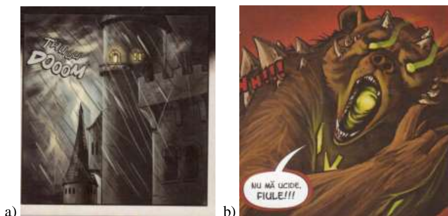
Fig. 1.a) The use of onomatopoeia ( Harap Alb Continuă – Album) b) Normal vs. bold fonts ( Harap Alb Continuă – Album)

DON'T KILL ME, SON! The desperate crying of the defeated emperor disguised in the bear skin eventually invokes the key word son , as a mean of saving his life, even with the risk of revealing his identity (see fig.1.b).