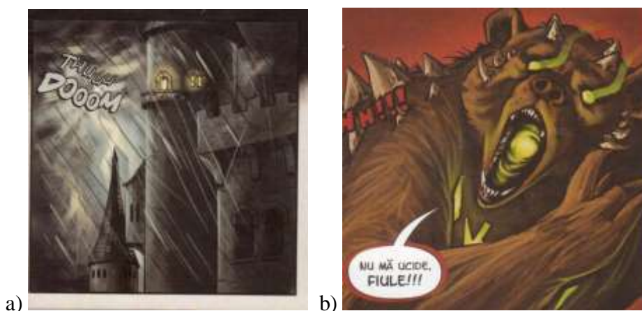
Fig. 1.a) The use of onomatopoeia ( Harap Alb Continuă – Album ) b) Normal vs. bold fonts ( Harap Alb Continuă – Album )

DON'T KILL ME, SON! The desperate crying of the defeated emperor disguised in the bear skin eventually invokes the key word son , as a mean of saving his life, even with the risk of revealing his identity (see fig.1.b).