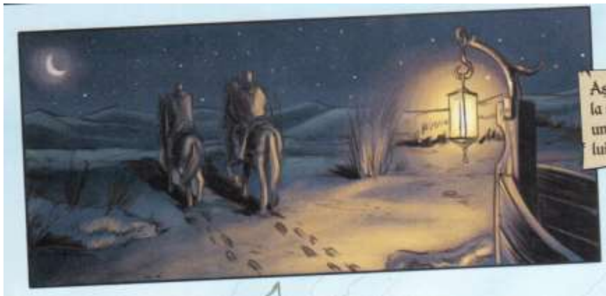
Fig. 6. Graphic elements to render action and time: footprints, moon ( Harap Alb Continuă – Album )

The notion of time is rendered in the adaptation through employing recognized images taken out of familiar experience, which convey action - footprints, smoke, and time - the moon, the sunrise (Eisner, 20) (see fig. 6).