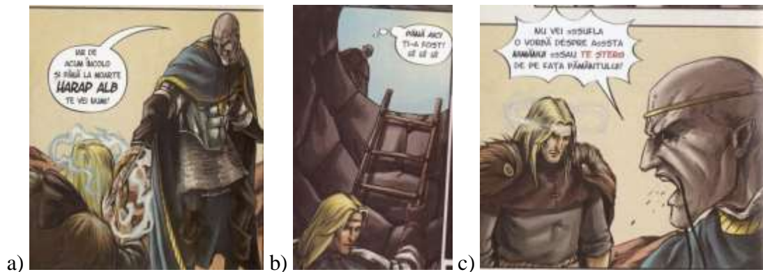
Fig. 8. a) Normal speech balloon b) Thought balloon c) Jagged edges balloon ( Harap Alb Continuă - Album)

The lettering inside the speech balloon and even the speech balloon's own shape reflect the nature and emotion of the speech, so they are mostly meant to capture characters' feelings. The normal speech balloon is the most common device found in the adaptation, followed by the thought balloon, which contains unspoken speech and the jagged edges balloon, which comprises loud and sharp sounds or desperate speech or howling (Eisner 27) (see fig. 8).