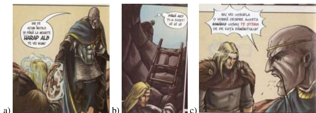
Fig. 8. a) Normal speech balloon b) Thought balloon c) Jagged edges balloon ( Harap Alb Continuă - Album)

The lettering inside the speech balloon and even the speech balloon's own shape reflect the nature and emotion of the speech, so they are mostly meant to capture characters' feelings. The normal speech balloon is the most common device found in the adaptation, followed by the thought balloon, which contains unspoken speech and the jagged edges balloon, which comprises loud and sharp sounds or desperate speech or howling (Eisner 27) (see fig. 8).