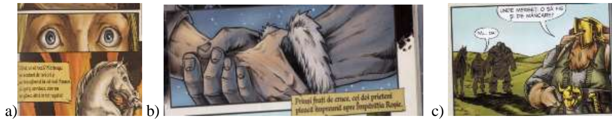
Fig. 5. a) Close-up panel of facial expressions b) Close-up panel of crucial moments c) Blurred elements ( Harap Alb Continuă – Album )

Time is an integrated dimension to comics. As in the human consciousness, it combines with space and sound. Whereas in different forms of auditory communication rhythm is related to the temporality, in graphics this experience is rendered by the use of illusions, symbols and their arrangement (Eisner 28-30).