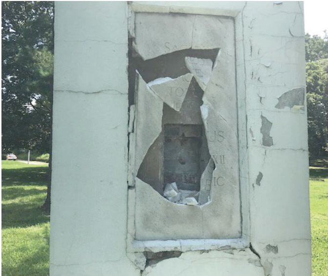
Figure 3. Columbus Obelisk, Herring Park, Baltimore ( The Baltimore Sun , August 21, 2017)

Although the holiday name had more to do with the ethnic meaning of Columbus's name than with the trope of discovery, current narratives point to 1492, that is, to the history that has to be retold to meet present needs. On the linguistic side, both the renaming of the holiday and the negative evaluation conveyed by the texts analyzed contribute to legitimizing the desecration of a once venerated symbol. As such, he is undoubtedly no longer worth celebrating. Both the interpersonal style and the rhetorical strategies employed in the texts analyzed leave no room for alternative viewpoints: other traditions take shape and nurture Indigenous People's Day, as the holiday has been renamed in about thirty cities in the last twenty-five years.