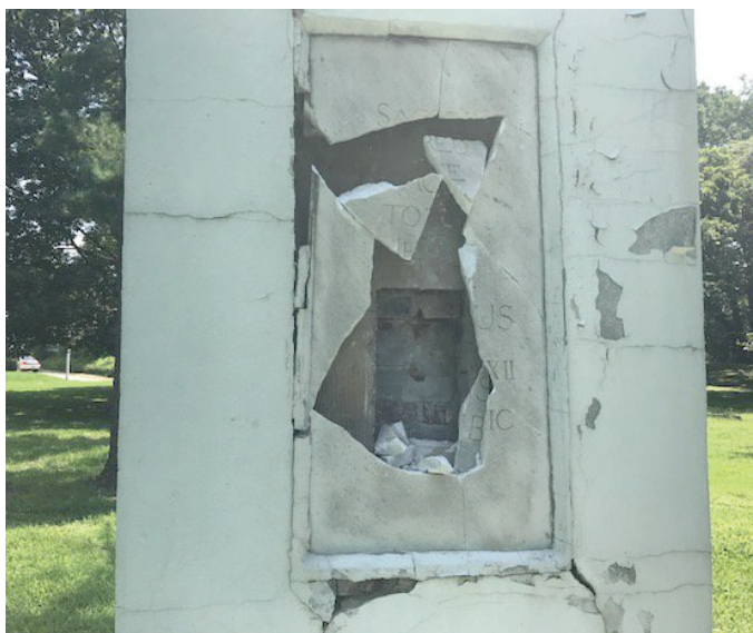
Figure 3. Columbus Obelisk, Herring Park, Baltimore

Although the holiday name had more to do with the ethnic meaning of Columbus's name than with the trope of discovery, current narratives point to 1492, that is, to the history that has to be retold to meet present needs. On the linguistic side, both the renaming of the holiday and the negative evaluation conveyed by the texts analyzed contribute to legitimizing the desecration of a once venerated symbol. As such, he is undoubtedly no longer worth celebrating. Both the interpersonal style and the rhetorical strategies employed in the texts analyzed leave no room for alternative viewpoints: other traditions take shape and nurture Indigenous People's Day, as the holiday has been renamed in about thirty cities in the last twenty-five years.