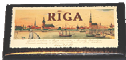
Picture No. 2. Chocolate Rīga is especially popular among tourists.

After 1990, in the years of independence, the usage of the name of the country in the names of commercial products and especially in the names of companies was restricted by instruction (Resolution No. 462, § 2.4 of the Council of Ministers of the Republic of Latvia, 04.11.1992) on purpose to protect oneself against belittling of the patriotic notion. Nevertheless there are such names in use – which are connected with luxury products, for instance: box of sweets Latvija , Rīga , chocolate Rīga , cheese Latvija , etc. (See Pictures No. 2, 3, 4.). One of the most favourite names in commercial products is Vecrīga ('Old Riga'): name of the cake Vecrīga , name of liqueur Vecrīga , etc. All these products are known with positive connotations. They are also meant to be enticing pieces of souvenirs.