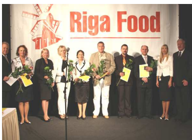
RĪGA FOOD (Picture No. 10.)