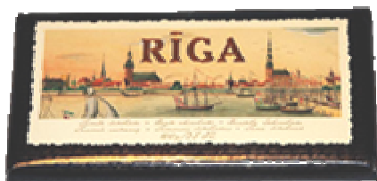
Picture No. 2. Chocolate Rīga is especially popular among tourists.

After 1990, in the years of independence, the usage of the name of the country in the names of commercial products and especially in the names of companies was restricted by instruction (Resolution No. 462, § 2.4 of the Council of Ministers of the Republic of Latvia, 04.11.1992) on purpose to protect oneself against belittling of the patriotic notion. Nevertheless there are such names in use – which are connected with luxury products, for instance: box of sweets Latvija , Rīga , chocolate Rīga , cheese Latvija , etc. (See Pictures No. 2, 3, 4.). One of the most favourite names in commercial products is Vecrīga ('Old Riga'): name of the cake Vecrīga , name of liqueur Vecrīga , etc. All these products are known with positive connotations. They are also meant to be enticing pieces of souvenirs.