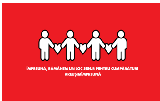
Figure 5. Mega Image new brand logo

heart, which makes us think of unity through emotions, by maintaining social distancing. The change is quite big and the intent of Mega Image is to convey the idea that people are at the heart of this change and it is still them that can go through this crisis together.