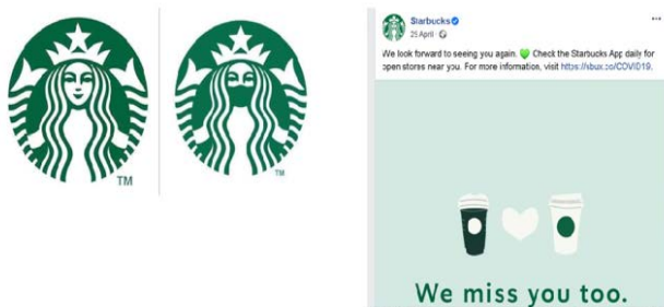
Figure 6. Starbucks new pandemic logo

Starbucks go with the message: „Check in with each other. We'll get through this together”, referring to one of the social networks' functions, that of checking in, but this this the check-in is no longer at the visited place but at home, and not tied to a place but rather to other persons we interact with online, as long as there are movement restrictions. In March, Starbucks transmitted a multitude of messages: through images (mask on the face) or by the texts associated to images: „Good things are still happening. ☺ We see stories of our customers and partners (employees) going the extra mile every day, but during this time these little acts of kindness shine even brighter” (25.03.2020, Facebook).