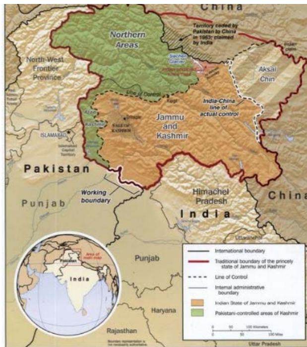
Figure 2. The disputed area of Kashmir (Washington: Central Intelligence Agency, 2002), Library of Congress Geography and Map Division Washington, D.C. 20540-4650 USA dcu.

Today, Google Maps will only show the state-mandated borders when accessed from within the country; its maps of India accessed from outside the country represent the conflicted areas in dotted lines.