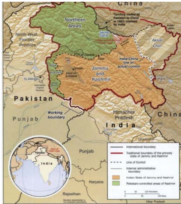
Figure 2. The disputed area of Kashmir (Washington: Central Intelligence Agency, 2002)

Today, Google Maps will only show the state-mandated borders when accessed from within the country; its maps of India accessed from outside the country represent the conflicted areas in dotted lines.