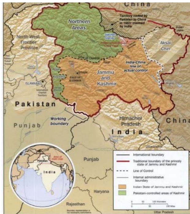
Figure 2. The disputed area of Kashmir (Washington: Central Intelligence Agency, 2002), Library of Congress Geography and Map Division Washington, D.C. 20540-4650 USA dcu.

Today, Google Maps will only show the state-mandated borders when accessed from within the country; its maps of India accessed from outside the country represent the conflicted areas in dotted lines.