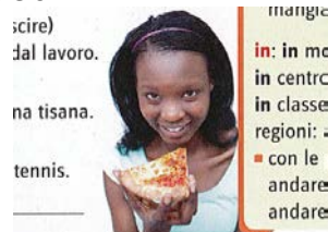
Table 3. FL textbooks for Italian. Some examples of representation of non-Ws

However, the statistical data about official migration rates to Italy (Eurostat, data from 2016) reports 0.5% of the population to be Ws and non-Ws immigrants, which is (surprisingly) low compared to the vivid impression about the reality in many Italian cities. Anyone who spends some time in Italy will get the impression that, in the last decade, in some areas of Italy the non-W persons, legal or supposedly illegal immigrants, are highly present, sometimes this being perceived as outnumbering the local inhabitants in some neighbourhoods.