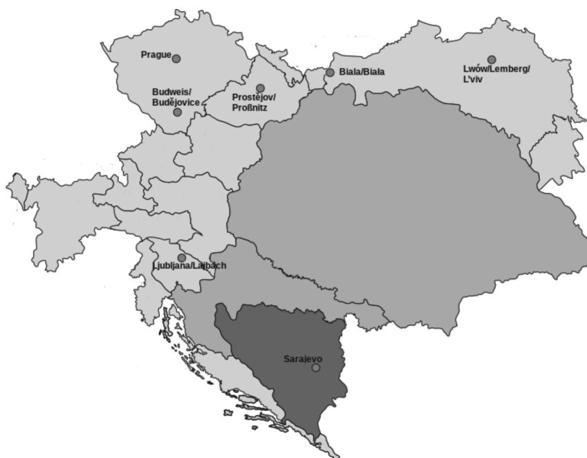
Map 1. Austria-Hungary (1878–1914) with the cities mentioned in the text (the author's work is based on Rowanwindwhistler's map from Wikimedia Commons, CC-BY-SA-3.0)

courted the Muslim camp and partly pursued the strategy that I call “three is less than two”. By this, I refer to the impression that adding a third language or a third script somehow plays down the more loathsome second one and takes the sting out of the surrender that its inclusion amounts to. Although the majority of literate Muslims in the province may have known only the Arabic script, imperial authorities were reluctant to expand its visibility and vetoed the idea of street signs complete with Arabic versions. They finally caved in, however, under the looming threat of a constitutional crisis (Juzbašić 2002: 255–257).