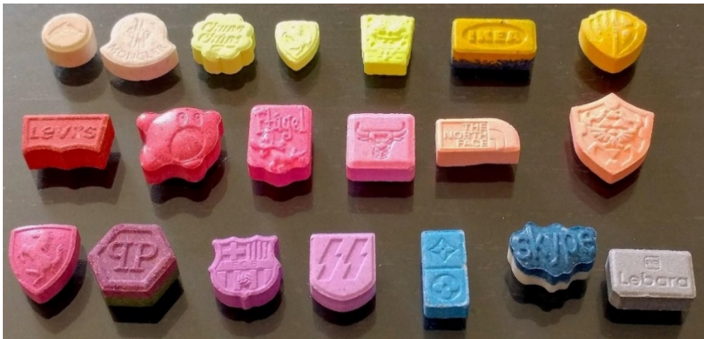
Figure 2: Ecstasy tablets with several logos, such as Warner Bros in the top right corner and Ferrari in the bottom left corner.

Vendor names also exploit the names of well-known brands and companies. The data contain 39 (5.0%) examples of these names, such as cocacola-crew , Dream Works , LAMBORGHINI2 , MonsterEnergyDrugs , starbucks101 and TESCOEXPRESS . Some brands are tightly connected to a country or known mainly on a national level ( AlbertHeijn , CzechAirlines , deBijenkorf , NORWEGIANcom 9 ) and thus make an indirect reference to the vendor's home country. Naturally, this type of unauthorised use of brands to gain financial benefit is a copyright violation, even though it would seem like a minor offense when compared to producing and distributing a vast amount of illegal drugs. As vendor names are not visible to a large audience, the damage caused to the reputation of brands and companies most likely remains small.