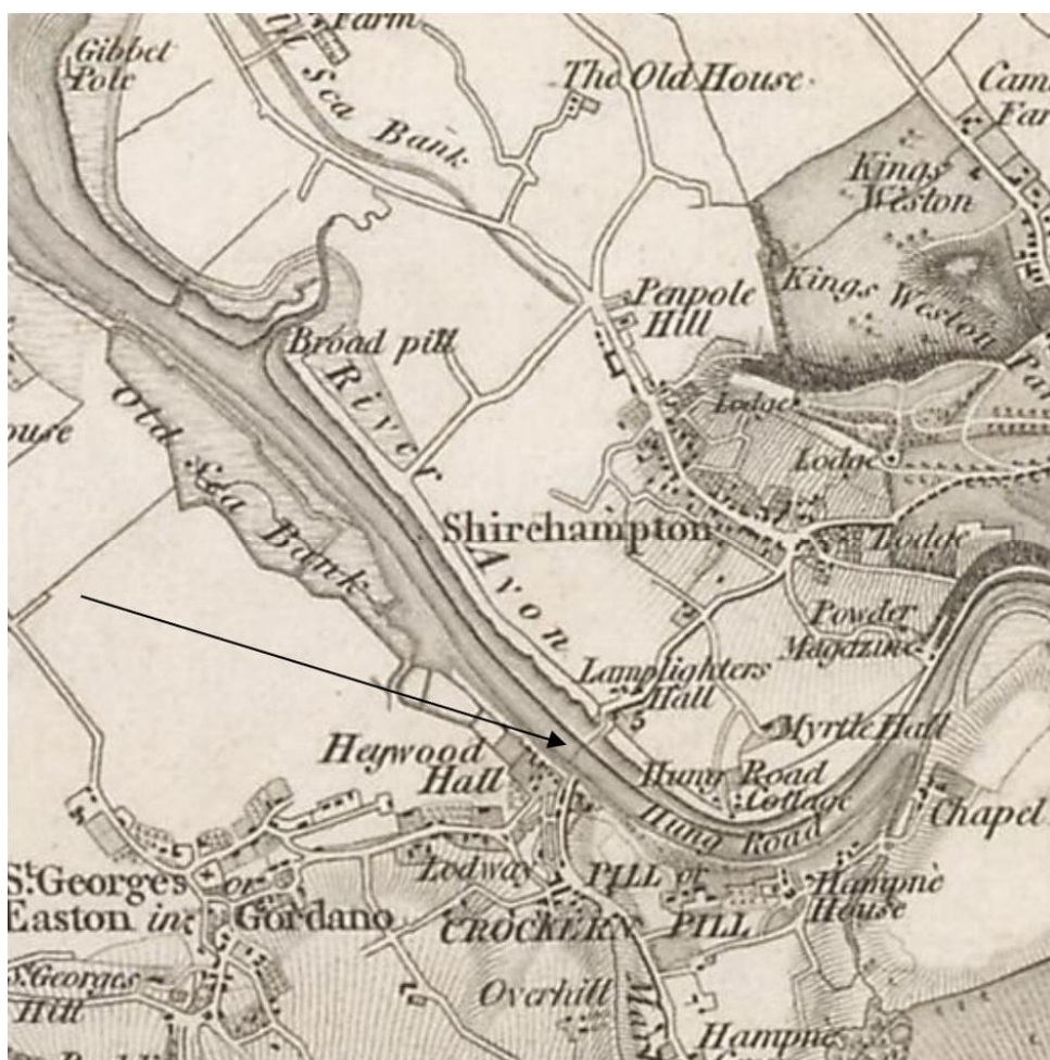
Figure 1: Map of Shirehampton in 1830 (Ordnance Survey), with the ferry to Pill arrowed

name or names featuring in the record, and some real-world consequences of that. All that may sound hyperacademic, pedantic and abstract, perhaps even mysterious, but the article itself is much concerned with the hard detail of the transmitted documentary record, and the intention is, as far as the evidence permits, to clarify what has often been obscure about the name(s) of this place. A. H. Smith took a mere seven lines of print to give an etymology for the dominant name-form set of Shirehampton (PN GI III: 132), one line of which is the heading and five the data, but without even addressing the current form of the name. 2 To get somewhere near exhausting what I think needs to be said, deserves to be said, and is revealing and entertaining about the local relation between language, geography, history and culture will take 36 pages of this journal.