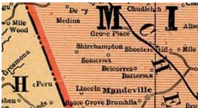
Figure 5: Excerpt from a map of 1901 by George F. Cram, Chicago