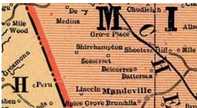
Figure 5: Excerpt from a map of 1901 by George F. Cram, Chicago