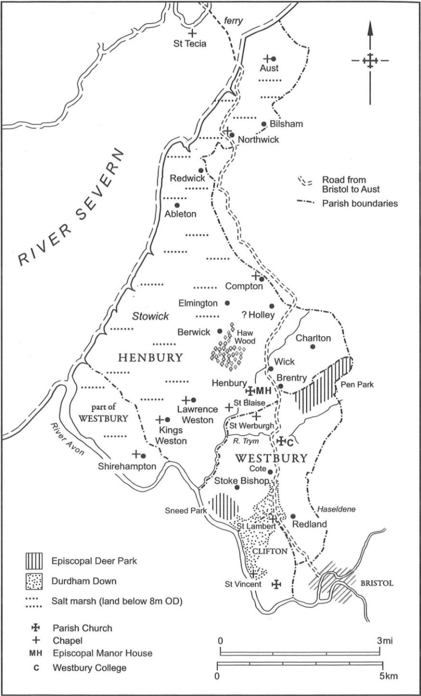
Figure 2: James Russell's map (in Orme & Cannon 2010) showing Shirehampton tithing in the wider context of Westbury and Henbury parishes.

also in Henbury hundred. The question of Shirehampton's detachment deserves further investigation, but this is not the place to do it.