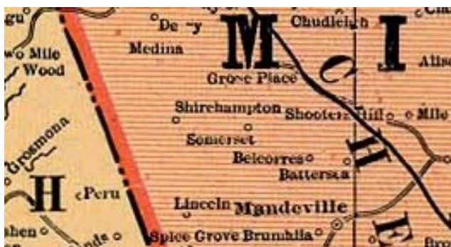
Figure 5: Excerpt from a map of 1901 by George F. Cram, Chicago