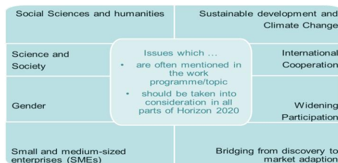
Fig.1. Cross-cutting issues in EU H2020 Programs, cf. www.cost.eu/participate

Gender mainstreaming is a priority objective of EU governments with regard to science. Binding target quotas are to further increase the proportion of women and achieve a percentage of at least 30% women in executive committees. Science organizations are jointly pursuing the target of an appropriate representation of women at all system levels. Giving men and women equal career opportunities requires broader, firmer establishment of family-friendly structures within organizations. Organizations must make even better use of existing instruments and seek to optimize such tools through regular mutual exchange of best practice.