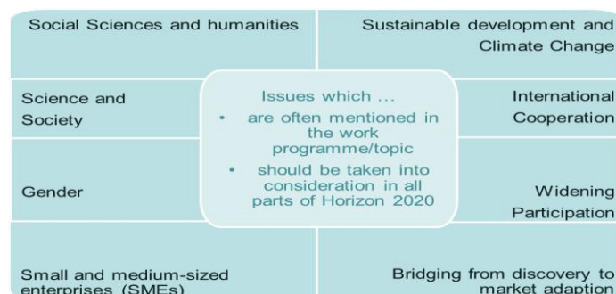
Fig.1. Cross-cutting issues in EU H2020 Programs, cf. www.cost.eu/participate

Gender mainstreaming is a priority objective of EU governments with regard to science. Binding target quotas are to further increase the proportion of women and achieve a percentage of at least 30% women in executive committees. Science organizations are jointly pursuing the target of an appropriate representation of women at all system levels. Giving men and women equal career opportunities requires broader, firmer establishment of family-friendly structures within organizations. Organizations must make even better use of existing instruments and seek to optimize such tools through regular mutual exchange of best practice.