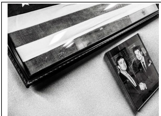
8

It is way below Ronald Reagan, with whom Trump claims to have been on good terms: "I helped him," he said of Reagan on NBC last fall. "I knew him. He liked me and I liked him." 9