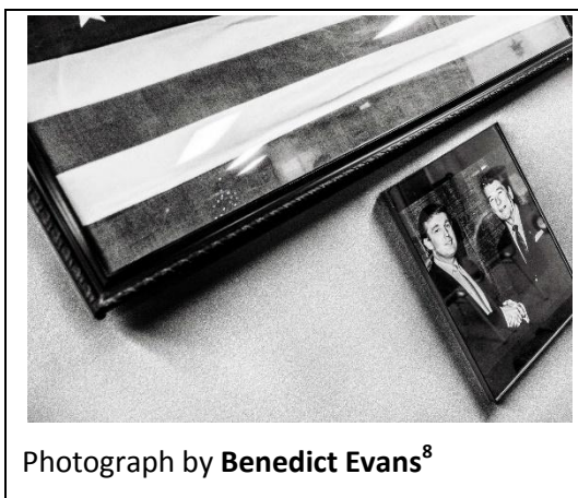
8

It is way below Ronald Reagan, with whom Trump claims to have been on good terms: "I helped him," he said of Reagan on NBC last fall. "I knew him. He liked me and I liked him." 9