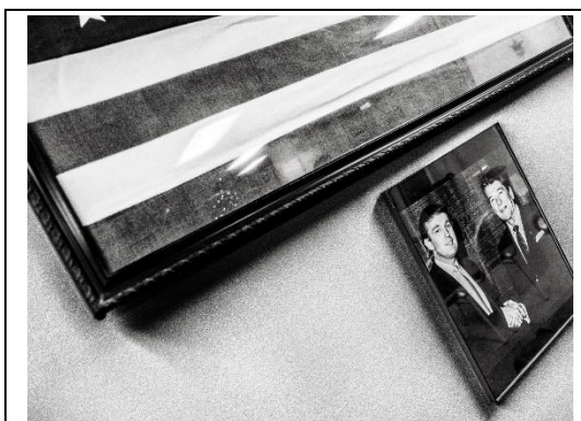
8

It is way below Ronald Reagan, with whom Trump claims to have been on good terms: "I helped him," he said of Reagan on NBC last fall. "I knew him. He liked me and I liked him." 9