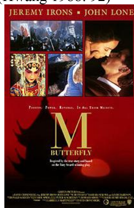
Fig. 2 Poster of the movie version of M. Butterfly (David Cronenberg, 1993)