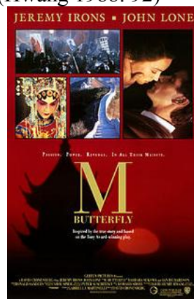
Fig. 2 Poster of the movie version of M. Butterfly (David Cronenberg, 1993)