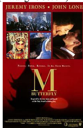
Fig. 2 Poster of the movie version of M. Butterfly (David Cronenberg, 1993)