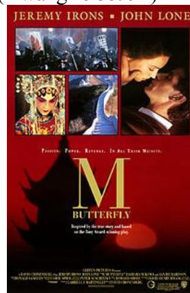
Fig. 2 Poster of the movie version of M. Butterfly (David Cronenberg, 1993)