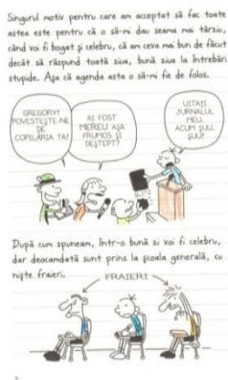
Fig. no. 1. A colour page of Diary of a Wimpy Kid

Also, another reason encountered at those who attended the reading club is that they could discuss certain events or even add to the book or colour the characters drawn.