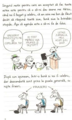
Fig. no. 1. A colour page of Diary of a Wimpy Kid

Also, another reason encountered at those who attended the reading club is that they could discuss certain events or even add to the book or colour the characters drawn.