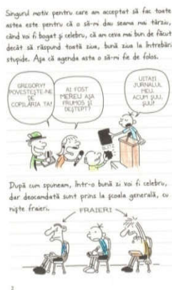
Fig. no. 1. A colour page of Diary of a Wimpy Kid

Also, another reason encountered at those who attended the reading club is that they could discuss certain events or even add to the book or colour the characters drawn.