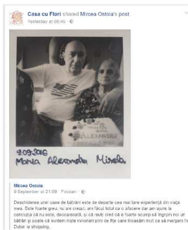
Fig. 3. #shareasmile and #nimeni page use (this is available on the link in footnote 3)