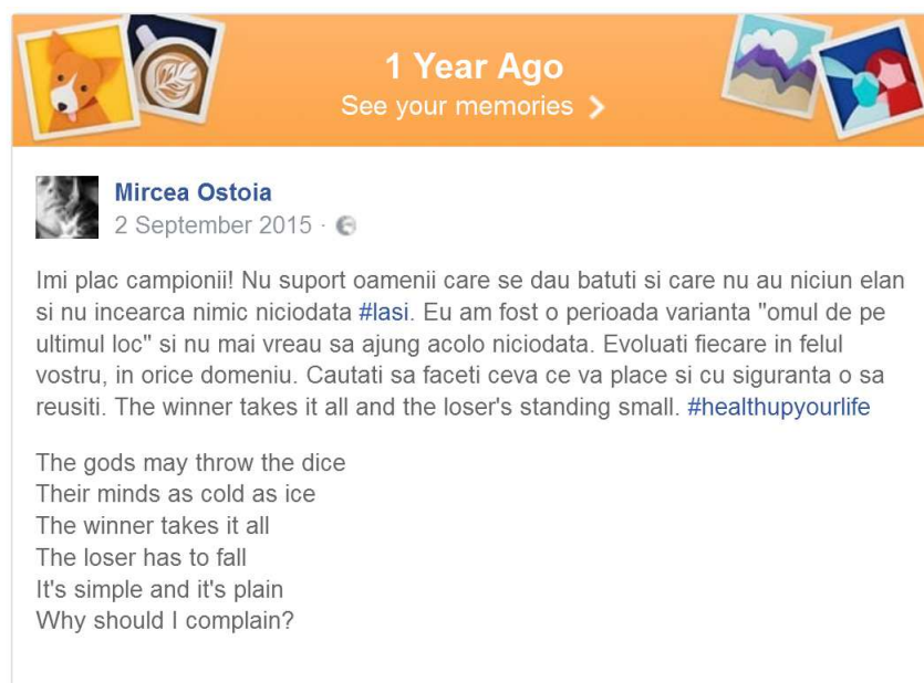
Fig. 2. Sample of #healthupyourlife (this is available on the link in footnote 2)

Using on the other hand this hashtag as a research tool in the sense of Roger's folksonomies retrieves a lot greater deal of posts all related to various aspects ranging from travel pictures to technology, from movies featuring characters that correspond to the struggle of succeeding to doctor's appointments and physiotherapy sessions, from food to sports equipment, from UNESCO world heritage sites pictures to the discovery of ancient relics. Such diversity of opinion is achieved in many ways. The first and the most commonly used is the self-produced text in which he comments an event, either personal or a repost, sometimes anchored in the political or social aspects of life from the generally interest public sphere or, as this is often the case, in smaller private life events of friends on Facebook. Besides these texts, he also hashtags widely circulating memes or photos he takes showing various general or familiar snapshots.