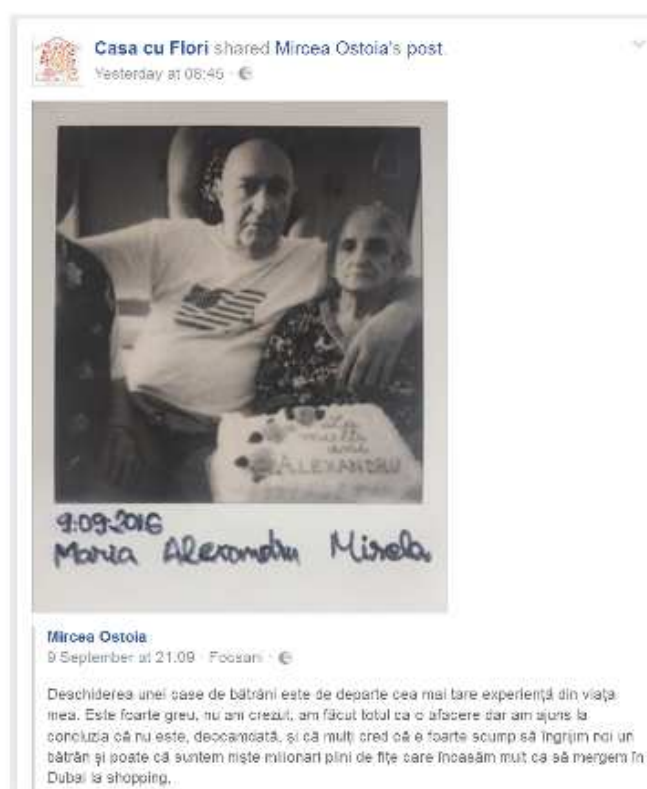
Fig. 3. #shareasmile and #nimeni page use (this is available on the link in footnote 3)