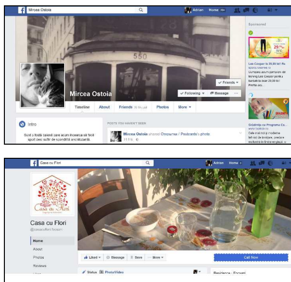
Fig. 1. The profile pages (these are available on the links in footnotes 2 and 3)

The Facebook profile pages used are Mircea Ostoia's 4 personal one and that of Casa cu flori 5 , the profile of a new retirement home owned by the same person. My research focuses on the wall postings on both profile pages starting with the date of the profile creation on Facebook and continuing until the moment this paper was written. The owner of these pages gave me the fully informed consent on using the information on these pages.