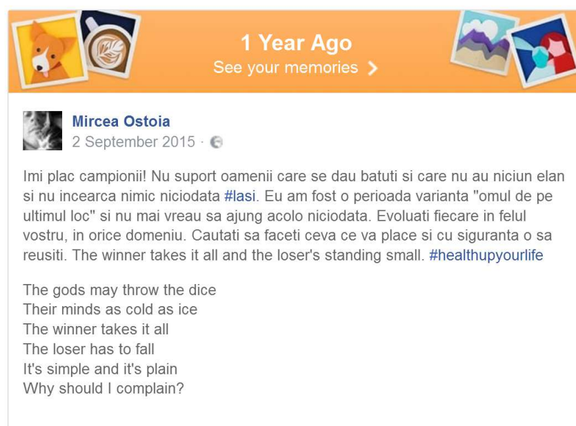
Fig. 2. Sample of #healthypyourlife (this is available on the link in footnote 2)

Using on the other hand this hashtag as a research tool in the sense of Roger's folksonomies retrieves a lot greater deal of posts all related to various aspects ranging from travel pictures to technology, from movies featuring characters that correspond to the struggle of succeeding to doctor's appointments and physiotherapy sessions, from food to sports equipment, from UNESCO world heritage sites pictures to the discovery of ancient relics. Such diversity of opinion is achieved in many ways. The first and the most commonly used is the self-produced text in which he comments an event, either personal or a repost, sometimes anchored in the political or social aspects of life from the generally interest public sphere or, as this is often the case, in smaller private life events of friends on Facebook. Besides these texts, he also hashtags widely circulating memes or photos he takes showing various general or familiar snapshots.