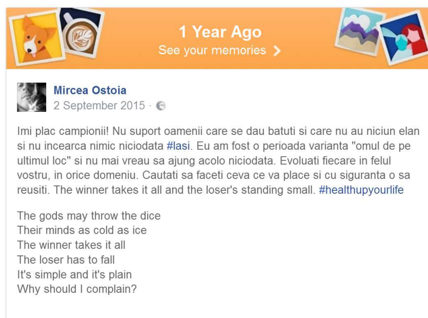
Fig. 2. Sample of #healthupyourlife (this is available on the link in footnote 2)

Using on the other hand this hashtag as a research tool in the sense of Roger's folksonomies retrieves a lot greater deal of posts all related to various aspects ranging from travel pictures to technology, from movies featuring characters that correspond to the struggle of succeeding to doctor's appointments and physiotherapy sessions, from food to sports equipment, from UNESCO world heritage sites pictures to the discovery of ancient relics. Such diversity of opinion is achieved in many ways. The first and the most commonly used is the self-produced text in which he comments an event, either personal or a repost, sometimes anchored in the political or social aspects of life from the generally interest public sphere or, as this is often the case, in smaller private life events of friends on Facebook. Besides these texts, he also hashtags widely circulating memes or photos he takes showing various general or familiar snapshots.