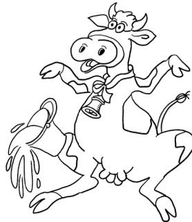
Picture 2 9 : The Proto-Germanic *kwon 10 (cow) gives the Proto-Germanic *meluks 11 (milk).