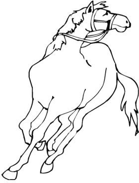
Picture 3 12 : The Proto-Germanic *stodo 13 (Stud) is engaged in his favourite pastime, the Proto-Germanic *rannjanan 14 (run).