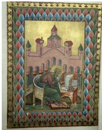
Fig. 2a) St. Evangelist Matthew, fol. 6 v