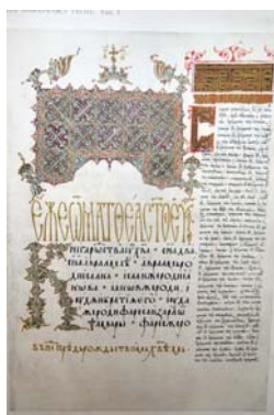
Fig. 1a) The first page of St Matthew's Gospel, fol. 7 r Gospel, fol. 90 r

As mentioned above, Ion Bianu reproduces ten images from the manuscript, and describes them accurately saying that “on four folios there are reproductions of the opening pages of the four Gospels, each of them with two headings in colour, one for the Slav text, which is the main one, and another one, smaller, for the Greek text [Fig. 1. a, b, c, d]. On other four folios the faces of the Evangelists are reproduced [Fig. 2. a, b, c, d]. A folio has secondary ornamentation and initials on it [Fig. 3], and the final folio has the epilogue of the text containing valuable data regarding its origins [Fig. 4]. Of a special importance are the portraits of the Evangelists, both for the variegated and rich borders and for the architectural motifs [which surround them], but especially for the manner in which the artist treats the figures of the writers” 1 .