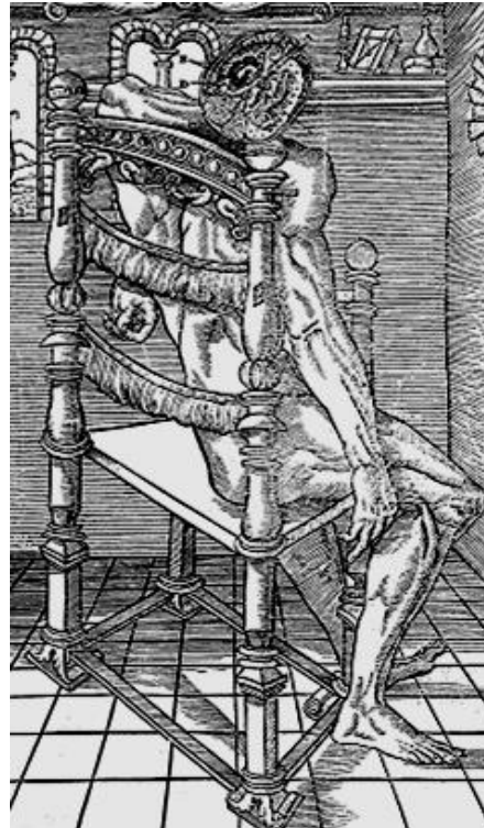
Fig. 2 Homo anatomicus : the brain ventricles. Detail of p. 241 in Charles Estienne and Estienne de la Rivière, De dissectione partium corporis humani (Paris, 1545)

The York Crucifixion is famous for the mis- and realignment of Jesus's limbs with the holes, yet the detail is more than a York, or even English, 23 occurrence: not only does the late thirteenth-century ME Northern Passion dramatise it to great lengths, but continental Passion plays capitalise on it too, 24 and so does religious iconography. 25 In York, once Jesus's right hand has been pinned down with hard strokes driving the peg through bone and sinew (Y35/101–3), the soldiers note the misalignment between the left hand, with shrunken sinews, and the hole drilled amiss (107–9, 111). Accordingly, they first pull Jesus's left hand (113–4, 119–20) into position for nailing down and then also his feet (135–42). Once the living body has been torturously nailed to the cross and symbolically fashioned into a psalter, it will be given a tremendous shake when the cross is erected and let fall into the large mortise. Here is the unsympathetic soldiers' commentary: