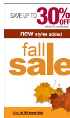
Figure 2: Term usage adapted to target market – fall [5]

Inbound marketing, through website content is the most efficient technique to deliver pertinent information that is straightforwardly accessible with the aid of search engines. Consequently, it is important to research the keywords by which web-users look for information that relates to the offer of products or services. Regardless of the type of localization (involving translation or not), keywords must be contained in web content and those keywords must match the signifiers used by the web-users to refer to common concepts (products or services). While this approach is not new, academics in Translation Studies most often touch upon the issue of onomasiology in passing and tend to overlook its importance in online communication.