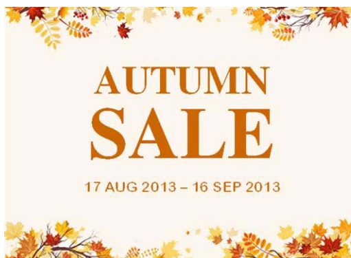
Figure 1: Term usage adapted to target market – autumn [4]

The importance of the onomasiological approach to website content localization can be expressed in simple terms with examples such as naming the “the third season of the year, when crops and fruits are gathered and leaves fall, in the northern hemisphere from September to November and in the southern hemisphere from March to May” [3] as autumn in the UK versus naming it fall in the US. Naming things or concepts differently can occur within the borders of the same country, with different naming of the same concept from region to region, called regionalisms . Referring back to my previous example, the localizer would use Autumn Sale for certain markets while Fall Sales for others.