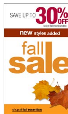
Figure 2: Term usage adapted to target market – fall [5]

Inbound marketing, through website content is the most efficient technique to deliver pertinent information that is straightforwardly accessible with the aid of search engines. Consequently, it is important to research the keywords by which web-users look for information that relates to the offer of products or services. Regardless of the type of localization (involving translation or not), keywords must be contained in web content and those keywords must match the signifiers used by the web-users to refer to common concepts (products or services). While this approach is not new, academics in Translation Studies most often touch upon the issue of onomasiology in passing and tend to overlook its importance in online communication.