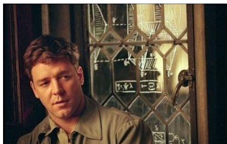
Fig. 4. Russell Crowe as John Forbes Nash, Jr. in A Beautiful Mind

Applying discursive psychology and a semiotic approach to the above extract, it represents a conversation between John and his self, a sign of introversion. As Figure 4 illustrates, John invented the window art; space becomes a topic of discussion, as the character uses the library’s windows for his mathematics analysis.