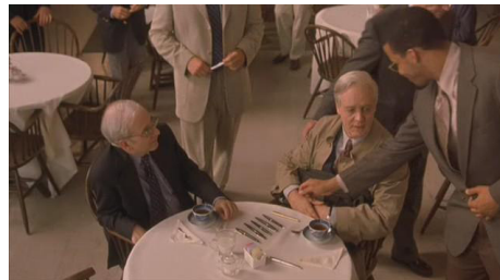
Fig. 5. The pen ceremony