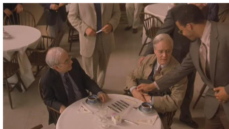
Fig. 5. The pen ceremony (www.imagesjournal.com)