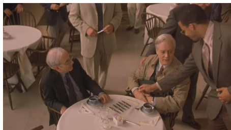
Fig. 5. The pen ceremony