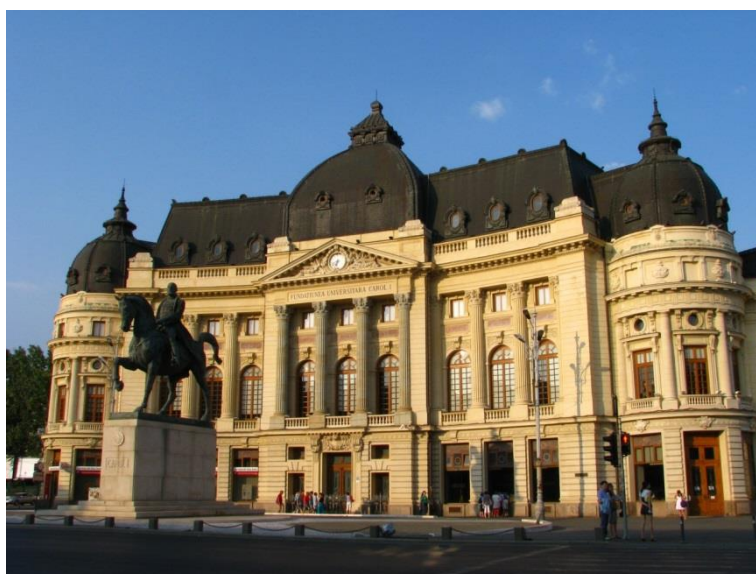
Figure 2 - Central University Library, Bucharest

The last record of him at the Beaux-Arts is in the beginning of 1866, the young student never getting beyond the second class. However, not graduating wasn't a problem at the time, since "in the nineteenth century they [Beaux-Arts students] had a higher status than that of many architects, for if a former student could rightfully call himself an architect and an ancien élève de l'École des Beaux-Arts , probably the latter title meant more" 7 . Unfortunately we don't have any record of him between 1866 and 1873 8 . He probably left school because, as many other Beaux-Arts students did, he decided to take a fulltime job as an architect.