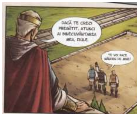
Fig. 2. Use of different font size to emphasize distance ( Harap Alb Continuă – Album )

There are panels which lack speech balloons, especially during action scenes, where speed forces the reader to supply the dialogue. Also, the shape of the panel frame or its absence is used not only as a stage for the action, but as a mean of involving the reader in the narrative, emphasizing the sensory dimension.