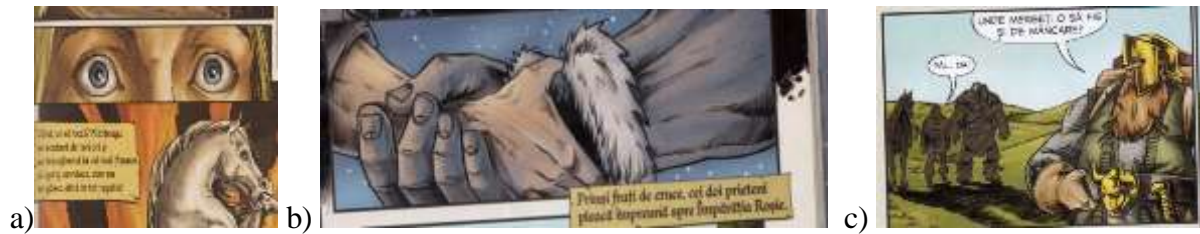
Fig. 5. a) Close-up panel of facial expressions b) Close-up panel of crucial moments c) Blurred elements ( Harap Alb Continuă – Album )

Time is an integrated dimension to comics. As in the human consciousness, it combines with space and sound. Whereas in different forms of auditory communication rhythm is related to the temporality, in graphics this experience is rendered by the use of illusions, symbols and their arrangement (Eisner 28-30).