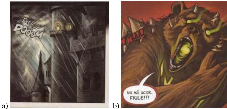
Fig. 1.a) The use of onomatopoeia ( Harap Alb Continuă – Album ) b) Normal vs. bold fonts ( Harap Alb Continuă – Album )

DON'T KILL ME, SON! The desperate crying of the defeated emperor disguised in the bear skin eventually invokes the key word son , as a mean of saving his life, even with the risk of revealing his identity (see fig.1.b).