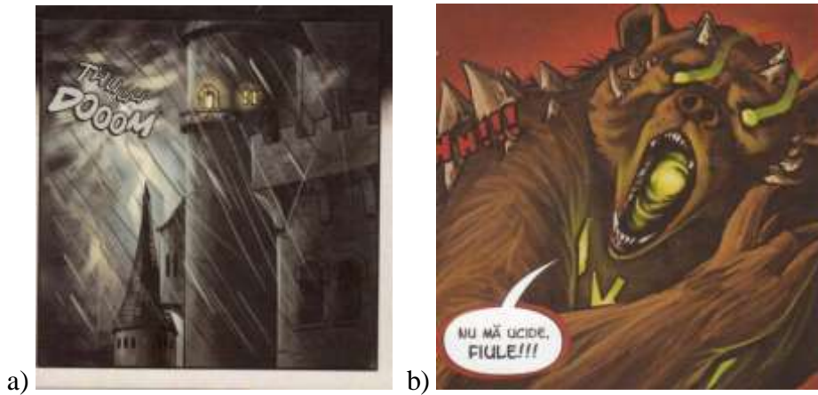
Fig. 1.a) The use of onomatopoeia ( Harap Alb Continuă – Album ) b) Normal vs. bold fonts ( Harap Alb Continuă – Album )

DON'T KILL ME, SON! The desperate crying of the defeated emperor disguised in the bear skin eventually invokes the key word son , as a mean of saving his life, even with the risk of revealing his identity (see fig.1.b).