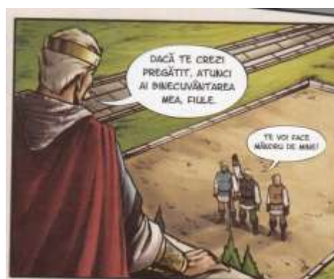
Fig. 2. Use of different font size to emphasize distance ( Harap Alb Continuă – Album)

There are panels which lack speech balloons, especially during action scenes, where speed forces the reader to supply the dialogue. Also, the shape of the panel frame or its absence is used not only as a stage for the action, but as a mean of involving the reader in the narrative, emphasizing the sensory dimension.