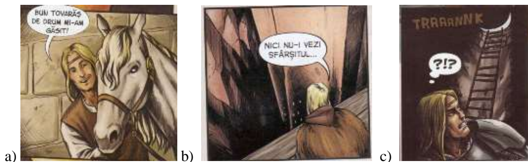
Fig. 9. a) Eye-level perspective b) Over-head perspective c) Ground-level perspective ( Harap Alb Continuă – Album)

In addition, there are used different perspectives to manipulate the reader's orientation and to produce various emotional states, influenced by his position as a spectator: the eye-level perspective to reinforce realism, whose purpose is to inform the reader; the over-head perspective, which provides a clear view of the settings, the reader acting as an observer; the ground-level perspective, which involves the reader in the impact of the action, inducing a sense of smallness and fear (see fig. 9). The same way function narrow panels, suggesting imprisonment, while wide panels make space, provide escape.