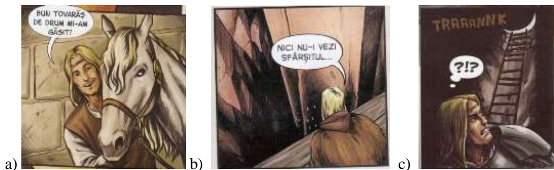
Fig. 9. a) Eye-level perspective b) Over-head perspective c) Ground-level perspective ( Harap Alb Continuă – Album)

In addition, there are used different perspectives to manipulate the reader's orientation and to produce various emotional states, influenced by his position as a spectator: the eye-level perspective to reinforce realism, whose purpose is to inform the reader; the over-head perspective, which provides a clear view of the settings, the reader acting as an observer; the ground-level perspective, which involves the reader in the impact of the action, inducing a sense of smallness and fear (see fig. 9). The same way function narrow panels, suggesting imprisonment, while wide panels make space, provide escape.