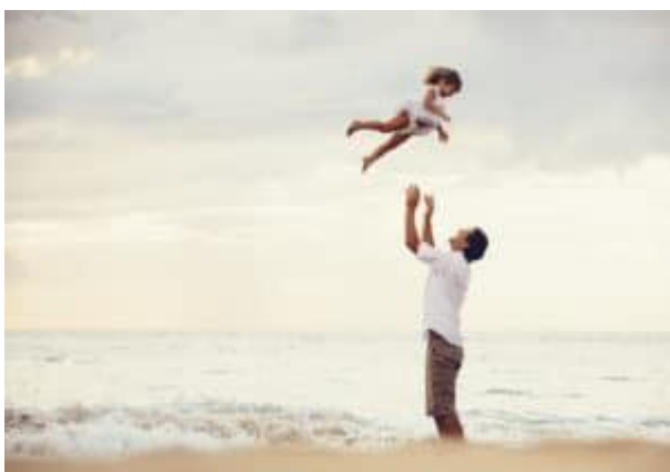
On the ball- quick to understand and react