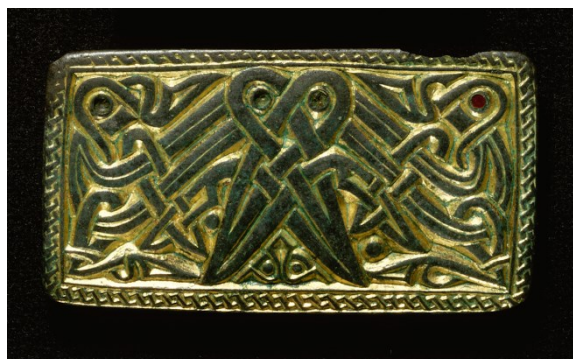
Figure 2: Style II plate fibula from Nørre Sandegård, Bornholm with entangled quadruped animals, broken symmetry and mask motifs.