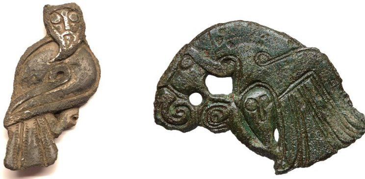
Figure 3: Recent finds of 7th/8th century bird motifs, both from Jutland, Denmark. Left: bird with human face, photo by the finder, Geoffrey de Visscher with kind permission, right: bird with mask in the thigh, photo by Søren Greve, Danish National Museum, license CC-BY-SA.

The birds that are represented in Scandinavian Iron Age personal names are almost completely restricted to ravens and perhaps hawks (Germanic names in general also include eagles, see Nedoma 2018 ). In animal art, ravens and birds of prey can be separated from each other by the shapes of beak and tail ( Høilund Nielsen 2001: 474 ). In later years, growing public interest in metal detecting, has produced several interesting finds that illustrate ideas of mixing between birds and humans ( Figure 3 ). These depictions are often understood in terms of Old Norse mythology as showing the god Odin in the shape of a bird ( Pentz 2018 ). But we could also choose to see such images as related to bird-man hybrids and identification with the bird motif. Such images, as well as the use of animals in personal names have been linked to the ideas of fylgja , hugr and hamr in Old Norse literature ( Breen 1997: 6–8 ; Kristoffersen 2010: 265 ). These terms represent abilities of the human soul to transform into animal shapes. Hedeager (2004: 232–234) sees the Iron Age human-animal relations as a ‘transcendental reality’ where boundaries between animal and human are crossed over or non-existing. Naming people for animals is seen by Hedeager (2011: 80–81) as expression of hybridity between humans, animals and birds and connected with shamanistic practices.