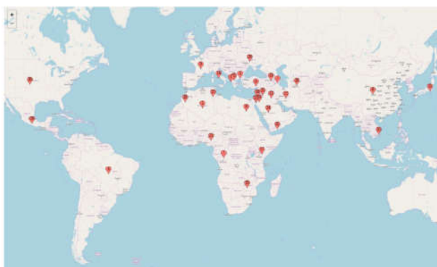
Figure 1. Countries of origin for APLR ASE students enrolled in 2014–2019 (map designed with www.mapcustomizer.com )

The programme, henceforth referred to as APLR ASE, was authorized in 2014 and accredited in 2017. In the period 2014–2019, APLR ASE enrolled more than 320 students from more than 30 countries across the globe, most of them from non-European countries: Albania, Algeria, Azerbaijan, Brazil, Bulgaria, China, Congo, Egypt, France, Georgia, Iran, Iraq, Israel, Italy, Japan, Jordan, Kenya, Lebanon, Mexico, Morocco, Nigeria, North Macedonia, Palestine, Saudi Arabia, Syria, Turkey, Tunisia, Turkmenistan, Ukraine, United States of America, Vietnam, Yemen and Zimbabwe. Figure 1 below captures the geographic distribution of the countries of origin of APLR ASE students: