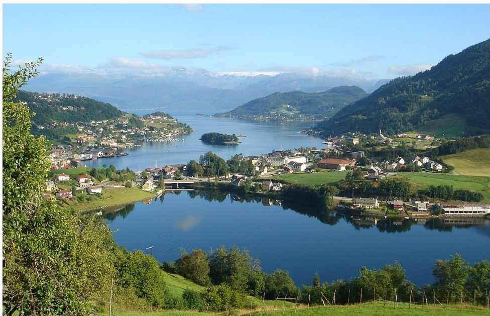
Figure 1: A view of part of the Hardanger Fjord from Norheimsund.

carried out this study, there were seven municipalities in Hardanger. The district has an area of 6268 km 2 (40.8% of Hordaland) and 22,918 residents (4.4% of the population in Hordaland, as of 2017, Thorsnæs 2017 ). Hardanger is famous for its stunning fjords. The sides of the fjords and the lower parts of some valleys are the main settlement areas. Industry, farming and tourist traffic play an important role in the economy there.