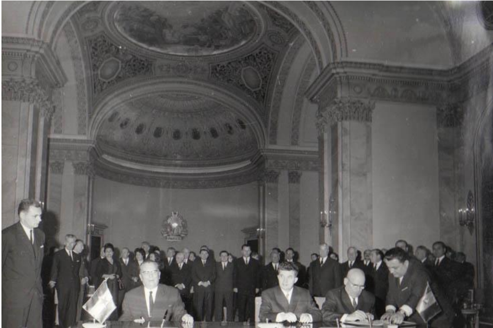
Figure 2. The former Throne Hall. The signing ceremony of the common declaration regarding the visit to Romania of Josip Broz Tito, the President of the Socialist Federal Republic of Yugoslavia. One can see the emblem of the socialist republic in the place where once the canopy overarched the throne, and the two surviving ceiling decorations (the frieze with armorial bearings and the fresco).

Communist Party, investiture ceremonies (Fototeca Online a Comunismului Românesc n.d.). For example, in April 1966, a meeting between Josip Broz Tito, the President of the Socialist Federal Republic of Yugoslavia, and Nicolae Ceaușescu, Secretary General of the Romanian Communist Party, took place in the former Throne Hall.