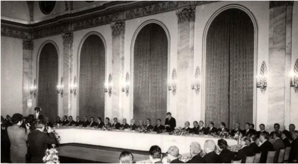
Figure 3. The meeting of the Council of the Political Consultative Committee of the states participating in the Warsaw Treaty. The official breakfast held in the former Royal Hall, 25-26 November 1976. Notice that King Ferdinand I's portrait, formerly hanging on the wall on the left side of the photo, was removed.

Pressmark: 332/1976