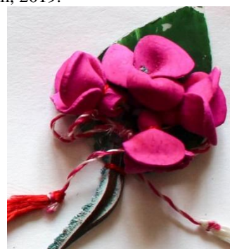
Photo 5: Mărțișor of tinder, dated 1960, Corund, Harghita–Transylvania, Collection: Rodica Belea, Timișoara–Banat; Photo made by Delia-Anamaria Răchișan, 2016.