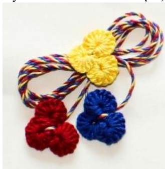
Photo 7b: Tricolor Mărțișor, dated 2007, the year Romania's integration in the European Union, Collection: Rodica Belea, Timișoara–Banat, Photo made by Delia-Anamaria Răchișan, 2019.

Photo 7a: Personal Archive, Photo made by Delia-Anamaria Răchișan, 2019.