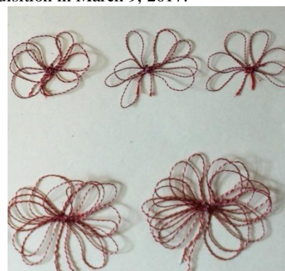
Photo 9: Lanyard for fairs and shows, Author: Rodica Belea, from Timișoara – Banat, Photo made by Delia-Anamaria Răchișan, 2019.