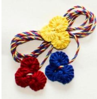
Photo 7b: Tricolor Mărțișor, dated 2007, the year Romania's integration in the European Union, Collection: Rodica Belea, Timișoara–Banat, Photo made by Delia-Anamaria Răchișan, 2019.

Photo 7a: Personal Archive, Photo made by Delia-Anamaria Răchișan, 2019.