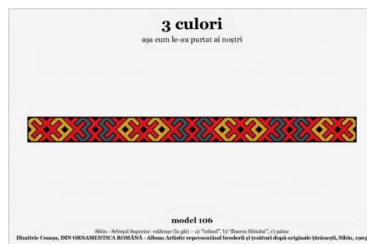
Photo 8a: Chromatic detail, Sibiu, Sebeșul Superior – Transylvania, Author: Ioana Corduneanu (drawing reproduced with traditional motifs, from the original peasant clothes), http://semne-cusute.blogspot.ro/search/label/3%20culori , Net acquisition in March 9, 2017.