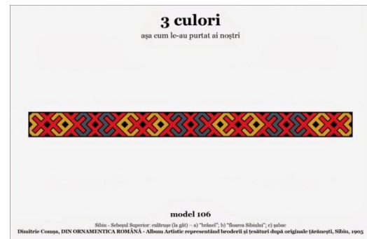
Photo 8a: Chromatic detail, Sibiu, Sebeșul Superior – Transylvania, Author: Ioana Corduneanu (drawing reproduced with traditional motifs, from the original peasant clothes), http://semne-cusute.blogspot.ro/search/label/3%20culori , Net acquisition in March 9, 2017.

Photo 7b: Tricolor Mărțișor, dated 2007, the year Romania's integration in the European Union, Collection: Rodica Belea, Timișoara–Banat, Photo made by Delia-Anamaria Răchișan, 2019.