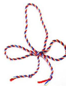
Photo 7a: Personal Archive, Photo made by Delia-Anamaria Răchișan, 2019.