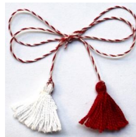
Photo 2: Mărțișor with tassel, one red and one white, Personal Archive , Photo made by Delia-Anamaria Răchișan, 2019.