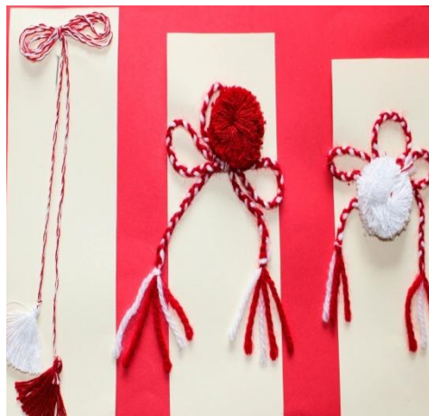
Photo 4: March Amulets, gift offered to March 8, for mothers and girls, models from 1950, similar to Romanian March Amulets – is wearing one days and then keep, Author: Ghizela Perjavaer, Sărmașu, Mureș – Transylvania, Collection: Rodica Belea,