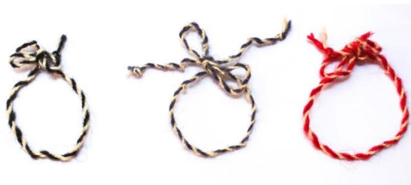
Photo 1: Woolen lanyard – black and white; white and blue; white and red, knotted at the ends, Personal Archive , Photo made by Delia-Anamaria Răchișan, 2019.