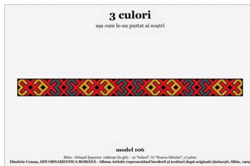
Photo 8a: Chromatic detail, Sibiu, Sebeșul Superior – Transylvania, Author: Ioana Corduneanu (drawing reproduced with traditional motifs, from the original peasant clothes), http://semne-cusute.blogspot.ro/search/label/3%20culori , Net acquisition in March 9, 2017.

Photo 7b: Tricolor Mărțișor, dated 2007, the year Romania's integration in the European Union, Collection: Rodica Belea, Timișoara–Banat, Photo made by Delia-Anamaria Răchișan, 2019.