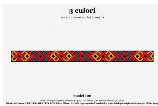
Photo 8a: Chromatic detail, Sibiu, Sebeșul Superior – Transylvania, Author: Ioana Corduneanu (drawing reproduced with traditional motifs, from the original peasant clothes), http://semne-cusute.blogspot.ro/search/label/3%20culori , Net acquisition in March 9, 2017.