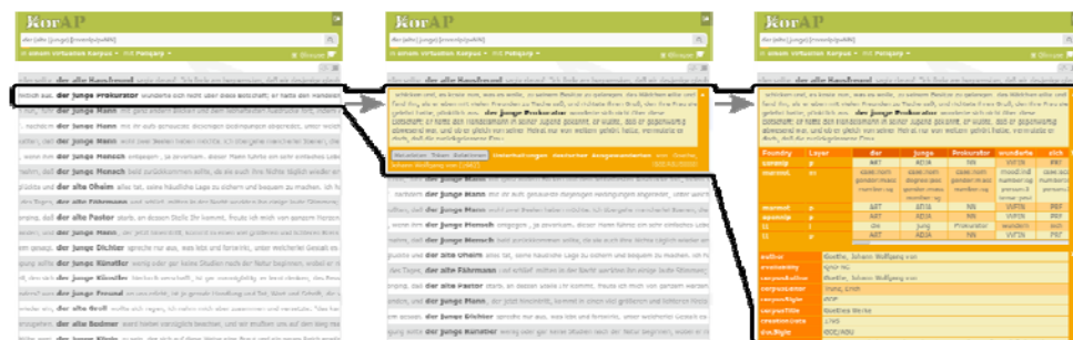
Fig. 3. With a few clicks, the user can gather all underlying data based on a match.

The user interface of KorAP is divided into several sections (called “panels”), which contain various functional information (see Fig. 4). Currently, panels are available for the following functional areas: a) the creation of the query, b) the display of the search result, c) the creation of the query. In the future, further functional areas are expected to be implemented as panels. These panels allow to provide “actions” (such as switching the text direction from left to right in the result area) and to embed several “views” (i.e. extras on demand ) into the corresponding panels to provide additional information for the respective area (such as showing statistical information about the virtual corpus, showing annotations about a match, or showing the underlying API response for results). This structure was introduced to ensure a high degree of extensibility to new functions without changing the overall appearance of the interface. It is also the basic structure for plugins (see Section 3). The panel-based layout has been designed to be suitable for different screen resolutions, although we assume that most complex tasks are still performed on desktop or laptop computers (as suggested by an early user tracking study in the KorAP instance of DeReKo).