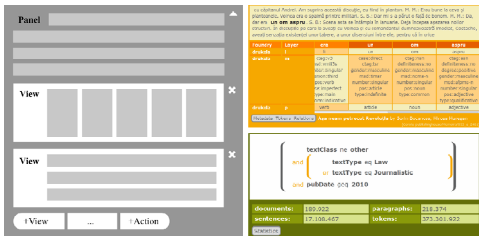
Fig. 4. “Panels”, “Views” and “Actions” as elements of the KorAP user interface.

The user interface of KorAP is divided into several sections (called “panels”), which contain various functional information (see Fig. 4). Currently, panels are available for the following functional areas: a) the creation of the query, b) the display of the search result, c) the creation of the query. In the future, further functional areas are expected to be implemented as panels. These panels allow to provide “actions” (such as switching the text direction from left to right in the result area) and to embed several “views” (i.e. extras on demand ) into the corresponding panels to provide additional information for the respective area (such as showing statistical information about the virtual corpus, showing annotations about a match, or showing the underlying API response for results). This structure was introduced to ensure a high degree of extensibility to new functions without changing the overall appearance of the interface. It is also the basic structure for plugins (see Section 3). The panel-based layout has been designed to be suitable for different screen resolutions, although we assume that most complex tasks are still performed on desktop or laptop computers (as suggested by an early user tracking study in the KorAP instance of DeReKo).