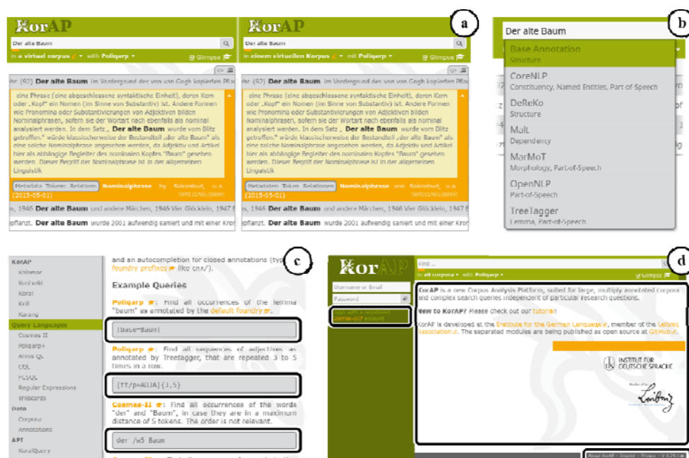
Fig. 7. a) Localization of the user interface, b) customization of the annotation assistant depending on the underlying corpus, c) customization of tutorial examples depending on the underlying corpus, d) customization of user interface templates.

For this reason, Kalamar is customizable in various ways. For example, a multilingual translation dictionary is utilized to provide the user with a localizable interface based on browser preferences (see Fig. 7a). German and English are available by default. For the DRuKoLA project, parts of the dictionary were adopted for Romanian as well.