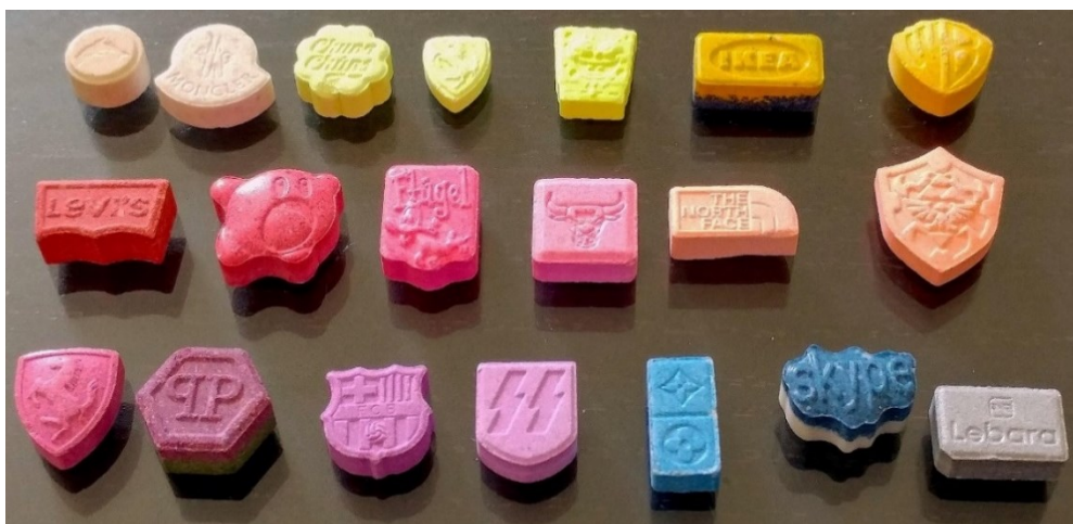
Figure 2: Ecstasy tablets with several logos, such as Warner Bros in the top right corner and Ferrari in the bottom left corner.

Vendor names also exploit the names of well-known brands and companies. The data contain 39 (5.0%) examples of these names, such as cocacola-crew , Dream Works , LAMBORGHINI2 , MonsterEnergyDrugs , starbucks101 and TESCOEXPRESS . Some brands are tightly connected to a country or known mainly on a national level ( AlbertHeijn , CzechAirlines , deBijenkorf , NORWEGIANcom 9 ) and thus make an indirect reference to the vendor's home country. Naturally, this type of unauthorised use of brands to gain financial benefit is a copyright violation, even though it would seem like a minor offense when compared to producing and distributing a vast amount of illegal drugs. As vendor names are not visible to a large audience, the damage caused to the reputation of brands and companies most likely remains small.