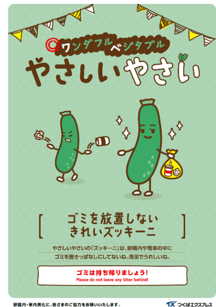
Fig. 3: Tsukuba Express, Yasashii yasai series, February 2019;

The poster in figure 5 is an example that shows the capacity of an advertisements to generate connections between a general desirable behavior and emotions, thus in this case through the anthropomorphism of a zucchini and other visual signs the receiver is persuaded by appeals to irrational, imagination, fantasy. The construction wandafuru bejitaburu (“Wonderful vegetables”) 「ワンダフルベジタブル」 position in the upper-most part of the poster, along words like yasashii (“kind”) and kirei (“nice”, “clean”) have the capacity to convey good vibes and to create a relaxing atmosphere while connecting these treaties to the act of keeping the train clean. Overall these constructions can be interpreted in a humorous note due to the association with vegetables, in this case zucchinis. The posture of the personified zucchinis is on one hand an index of anger and disregard towards the rules and on the other one of obedience and tranquility of a model citizen meeting society’s expectations. The construction isolated through square brackets: Gomi o hōchi shinai kirei zukkinii (“Nice zucchinis do not litter”) is a statement of the fusion, the interferences between real and surreal and it creates a link between a real occurrence and fantasy. The idea is exploited further in small print: Yasashii yasai no “Zucchini” wa, ekikōnai ya shanai no naka ni gomi wo okippanashi ni shitenai ne. Seiketsu de ureshii ne. (“Nice