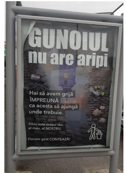
Fig. 2: Sibiu Town Hall campaign, 2017;

In the same manner, figure 3 is an example of a Japanese print advertisement from an anti-litter campaigns to raise awareness. The difference between the two advertisements is visible from the start in terms of visual signs, at least. This poster is part of a 2019 campaign started at the initiative of Sapporo City Hall. Even though the two posters were created for the same purpose the constituent signs differ considerably and this can be explained from world view which is strongly related to culture and traditions. In this sense, advertisements can be perceived as a reflection of a specific culture and society in a specific timeframe. As opposed to Romanian public, non-commercial advertisements Japanese ones have the tendency to