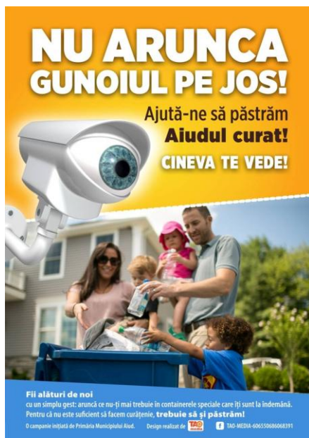
Fig. 4: City of Aiud anti-littering campaign, 2017;

The poster represented in figure 4 is another example of Romanian public service advertisement considering littering and its impact on the environment. It is part of a 2017 anti-littering campaign conducted in Aiud, a small city in Alba County at the request of the City