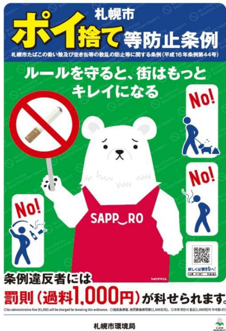
Fig. 3: City of Sapporo anti-litter campaign, 2019;

The text is written entirely in Japanese except the negation word “no” which is marked with red and written in English in order to emphasize the importance of obeying the rules. Even though it is not common that these sort of advertisements emphasize on negation words and imperative forms, but rather on a more indirect form of addressing in this case there is a mix between direct, explicit assertions and implicit one manifested through kawaii (‘cute’) aesthetic