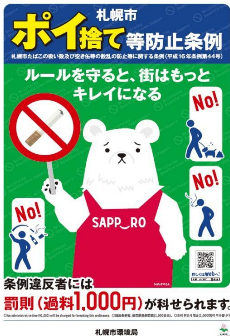
Fig. 3: City of Sapporo anti-litter campaign, 2019;

The text is written entirely in Japanese except the negation word “no” which is marked with red and written in English in order to emphasize the importance of obeying the rules. Even though it is not common that these sort of advertisements emphasize on negation words and imperative forms, but rather on a more indirect form of addressing in this case there is a mix between direct, explicit assertions and implicit one manifested through kawaii (‘cute’) aesthetic