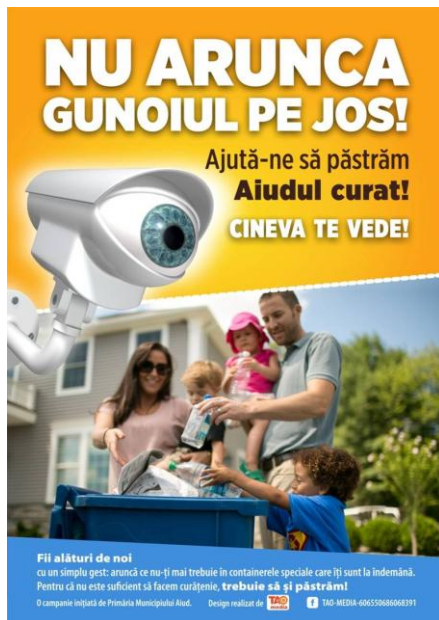
Fig. 4: City of Aiud anti-littering campaign, 2017;

The poster represented in figure 4 is another example of Romanian public service advertisement considering littering and its impact on the environment. It is part of a 2017 anti-littering campaign conducted in Aiud, a small city in Alba County at the request of the City