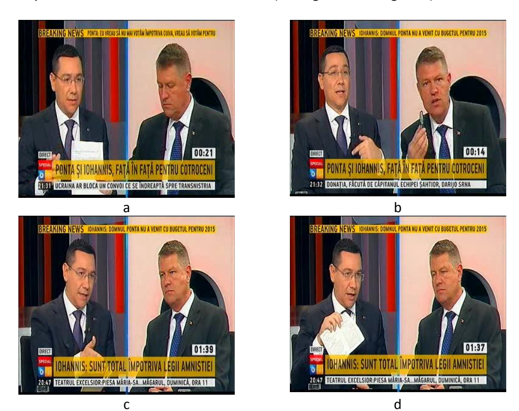
Figure 1. The relationship between gestures and ideological orientation in the case of the candidate affiliated to the left wing, Victor Ponta: a, b, c - gestures executed with the left hand; d - gesture executed with the right hand.

November 2014. Every frame captures a particular aspect of the gesture - ideological orientation relationship, being selected on the basis of the multimodal analysis conducted with the ELAN software (see Figure 2 and Figure 4).