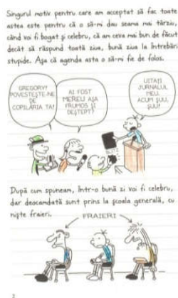
Fig. no. 1. A colour page of Diary of a Wimpy Kid

Also, another reason encountered at those who attended the reading club is that they could discuss certain events or even add to the book or colour the characters drawn.