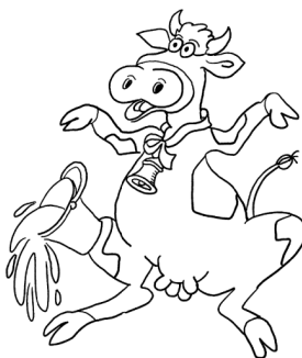
Picture 2 9 : The Proto-Germanic *kwon 10 (cow) gives the Proto-Germanic *meluks 11 (milk).