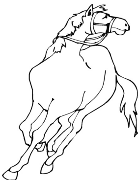
Picture 3 12 : The Proto-Germanic *stodo 13 (Stud) is engaged in his favourite pastime, the Proto-Germanic *rannjanan 14 (run).