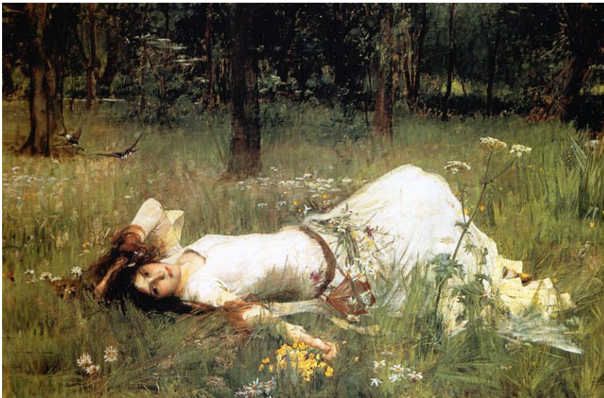
1. John William Waterhouse, Ophelia , 1889, private collection