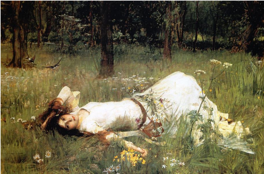
1. John William Waterhouse, Ophelia , 1889, private collection