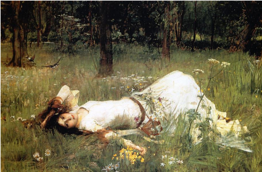
1. John William Waterhouse, Ophelia , 1889, private collection