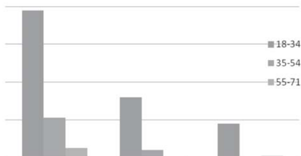
Diagram 1. English language skills and the age of respondents

If language skills are analysed according to the socio-demographic variables, certain differences are evident: Hungarian speakers living in countryside know in a lesser degree both the state language (Romanian) and a foreign language than those who live in large towns. The differences are even more striking between younger and older speakers. Almost 20% of the young respondents (18–34 years old) declared that they spoke English very well. That proportion is 5.3% among middle-aged (33–54 years old) respondents and 1.2% among older respondents ( Diagram 1 ).