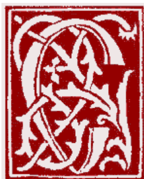
Figure 6, Oktoih (1494)- Letter