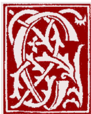
Figure 6, Oktoih (1494)- Letter