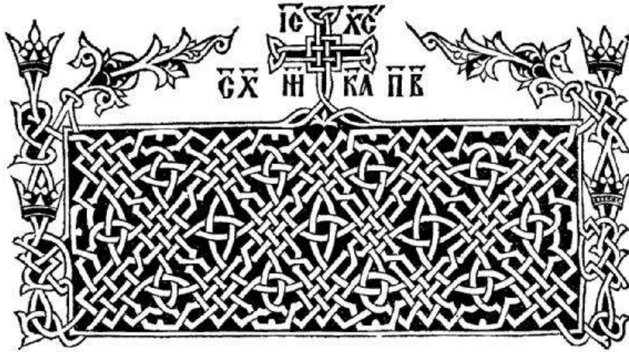
Figure 2, Oktoih (1510)- Rectangular frontispiece