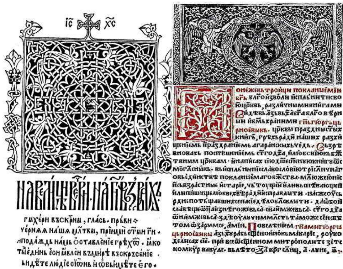
Figure 4, Oktoih (1510) - The arm frontispiece