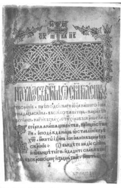
Figure 7, Oktoih (1510)- Initial letter