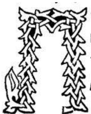
Figure 8, Oktoih (1510), Letter