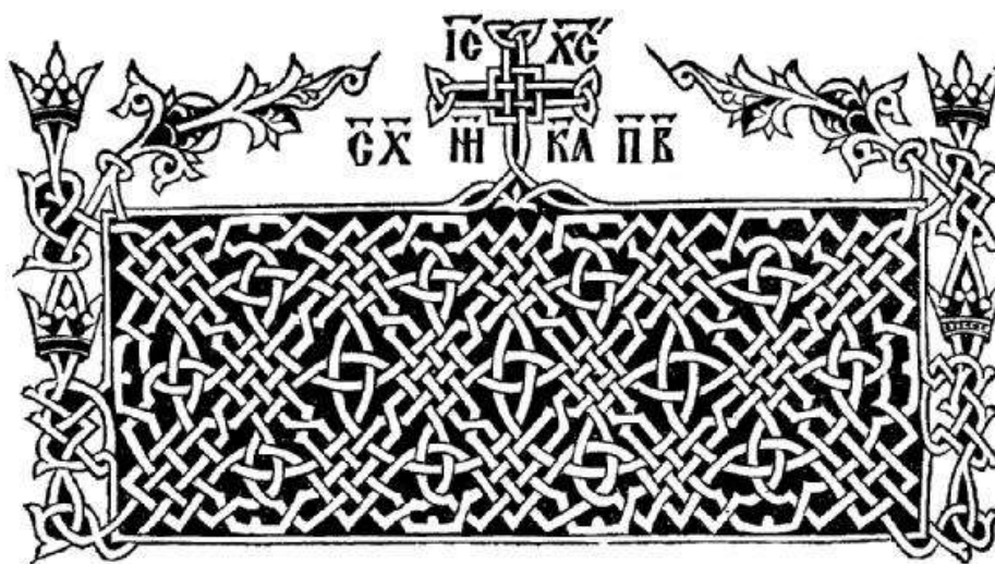
Figure 2, Oktoih (1510)- Rectangular frontispiece