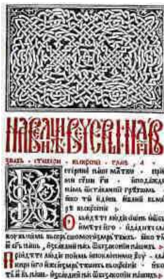
Figure 3, Oktoih (1494)- Frontispiece