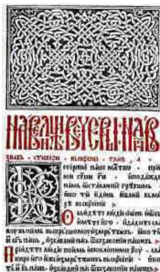
Figure 3, Oktoih (1494)- Frontispiece