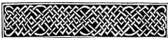
Figure 9, Oktoih (1510), Decorated frame