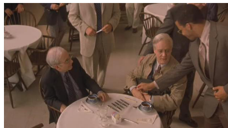
Fig. 5. The pen ceremony