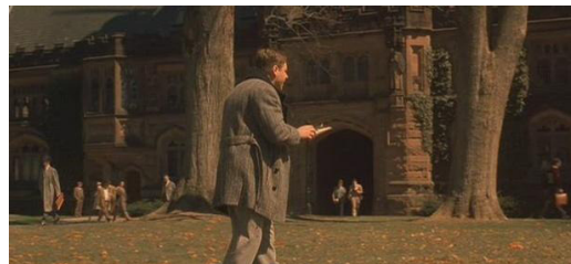
Fig. 2 Russell Crowe as John Forbes Nash, Jr. in A Beautiful Mind.

If the discursive psychology is applied to the conversational turns, the social action that John promotes is his intention to find an algorithm to define the pigeons’ movement; it is the world that Nash constructs for himself in order to find the original idea. His reply makes his colleagues label him as psycho ; the university courtyard where John analyses the pigeons represents the location where he develops his occupational identity. Figure 2 illustrates the movie picture including the setting representative for the above interaction and it also illustrates the public distance Nash exerts towards his colleagues that he treats as complete strangers.