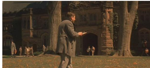
Fig. 2 Russell Crowe as John Forbes Nash, Jr. in A Beautiful Mind.

If the discursive psychology is applied to the conversational turns, the social action that John promotes is his intention to find an algorithm to define the pigeons’ movement; it is the world that Nash constructs for himself in order to find the original idea. His reply makes his colleagues label him as psycho ; the university courtyard where John analyses the pigeons represents the location where he develops his occupational identity. Figure 2 illustrates the movie picture including the setting representative for the above interaction and it also illustrates the public distance Nash exerts towards his colleagues that he treats as complete strangers.