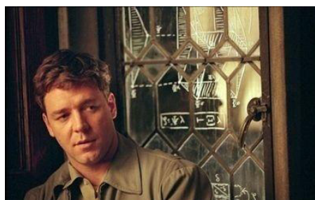
Fig. 4. Russell Crowe as John Forbes Nash, Jr. in A Beautiful Mind (www.imagesjournal.com)

Applying discursive psychology and a semiotic approach to the above extract, it represents a conversation between John and his self, a sign of introversion. As Figure 4 illustrates, John invented the window art; space becomes a topic of discussion, as the character uses the library’s windows for his mathematics analysis.