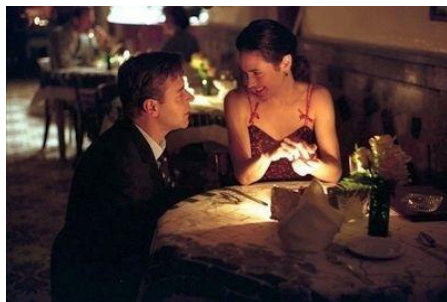
Fig. 3. Russell Crowe and Jennifer Connelly in A Beautiful Mind .