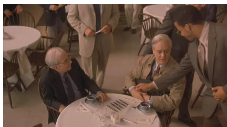
Fig. 5. The pen ceremony