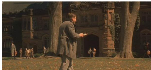
Fig. 2 Russell Crowe as John Forbes Nash, Jr. in A Beautiful Mind.

If the discursive psychology is applied to the conversational turns, the social action that John promotes is his intention to find an algorithm to define the pigeons’ movement; it is the world that Nash constructs for himself in order to find the original idea. His reply makes his colleagues label him as psycho ; the university courtyard where John analyses the pigeons represents the location where he develops his occupational identity. Figure 2 illustrates the movie picture including the setting representative for the above interaction and it also illustrates the public distance Nash exerts towards his colleagues that he treats as complete strangers.