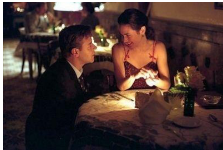
Fig. 3. Russell Crowe and Jennifer Connelly in A Beautiful Mind .