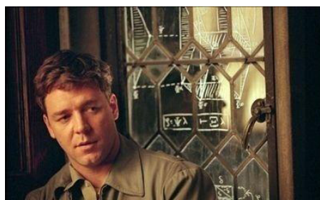
Fig. 4. Russell Crowe as John Forbes Nash, Jr. in A Beautiful Mind (www.imagesjournal.com)

Applying discursive psychology and a semiotic approach to the above extract, it represents a conversation between John and his self, a sign of introversion. As Figure 4 illustrates, John invented the window art; space becomes a topic of discussion, as the character uses the library’s windows for his mathematics analysis.