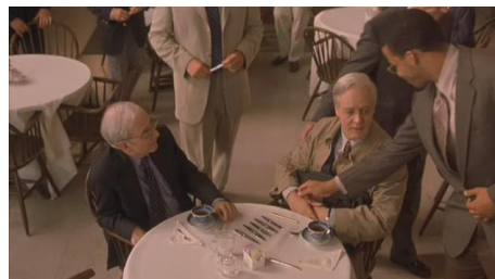
Fig. 5. The pen ceremony