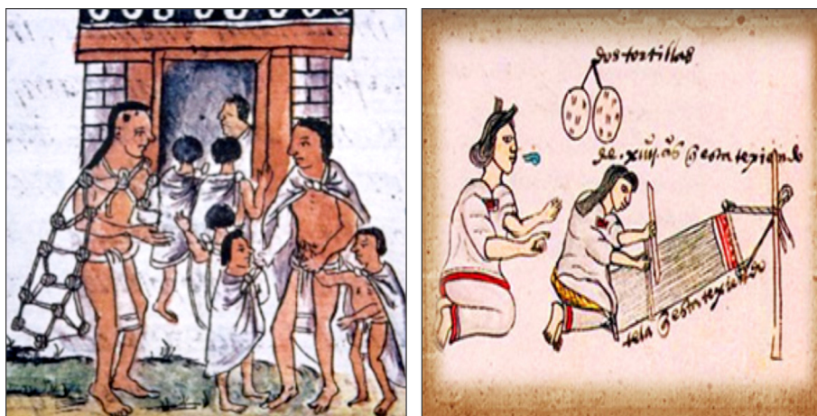
Figure 10. Aztec boys being educated at the Teocalli ; Aztec girls being trained in the art of weaving, 16 th century.

Do not walk with haste nor too slowly, because walking slowly is a sign of pomp and walking quickly gives out an aftertaste of anxiety and restlessness. You will walk straight with your head slightly bowed. 13(OT)