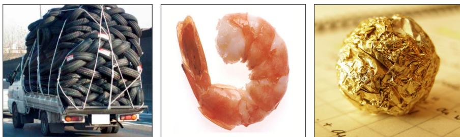
Figure 15. Everything fits, the carried-away shrimp, and false gold

The refrán is a poetic construction that has proliferated with the intention to transmit teachings and to promote a kind of morality based on experience. There is always a refrán for any situation, a kind of proverb dressed in a metaphorical saying decorated in metonyms. Besides the verbal folklore of Mexico, experiences, suspicions, malice and popular sharpness are reflected always with spirit and a touch of liveliness in the transmission of its teachings. Although introduced from Europe and having its origins in fables and proverbs of Hellenic times (and even further back to Mesopotamia), the refrán in Mexico has developed local characteristics and terms, giving it a particular tinge understood by Mexicans as theirs . Besides, new refranes are being created continuously. A Mexican refrán ? It is a poetic construction that has proliferated with the intention to transmit teachings and learned experiences, to inculcate a kind of morality derived from its message, often using local parole or modisms. Those idioms often are only understood locally (see Figure 16).