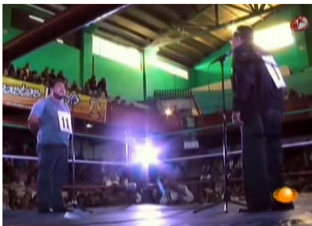
Figure 9. Two contestants at the Festival del Albur in Pachuca

Víctor Henández in his anthology of the Mexican albur ( Antología del Albur Mexicano , 2006) considers that the prevalence and propagation of the albur is due to the fact that in Mexican culture, good behaviour and good manners tend to be prioritized.. 12 For which this would be a way to transcend those good manners in a playful way – that is, as a means to violate the rules. But we shall like to propose further factors to Hernández's theory for this cultural phenomenon as a reaction to mores; these lie further back in Mexico's particular history, rooted in the cultures of pre-Hispanic Mexico.