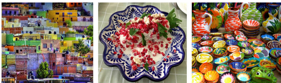
Figure 1. Characteristic houses, food and utilitarian objects

ingenuity, humour and often, a festive sense. This creativity is visible in the colours people paint their houses, as well as in the food and objects with which they decorate or surround their immediate environments, such as shops, workshops, eating places and small businesses(see Figure 1).