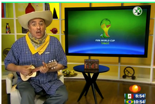
Figure 8. Víctor Trujillo as El Charro Amarillo , on television, Televisa channel, 2010.

ENTONATION: Another variant of INSINUATION proceeds even if the additional meaning added to words and themes is not common knowledge or normally understood. It is in the way the phrases are put together and the timbre of the voice used to chant the utterance that will set up that utterance as an albur , for which the other person would have to respond in a likely way. Even simple commentaries in everyday chores can be understood as an albur , a motive for mischievous humour – such as a secretary asking her boss: