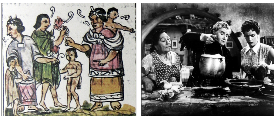
Figure 16. Wisdom being passed on within a pre-Columbian family as in the 20 th Century in the film, Los Fernández de Peralvillo , 1954.

The refrán is a poetic construction that has proliferated with the intention to transmit teachings and to promote a kind of morality based on experience. There is always a refrán for any situation, a kind of proverb dressed in a metaphorical saying decorated in metonyms. Besides the verbal folklore of Mexico, experiences, suspicions, malice and popular sharpness are reflected always with spirit and a touch of liveliness in the transmission of its teachings. Although introduced from Europe and having its origins in fables and proverbs of Hellenic times (and even further back to Mesopotamia), the refrán in Mexico has developed local characteristics and terms, giving it a particular tinge understood by Mexicans as theirs . Besides, new refranes are being created continuously. A Mexican refrán ? It is a poetic construction that has proliferated with the intention to transmit teachings and learned experiences, to inculcate a kind of morality derived from its message, often using local parole or modisms. Those idioms often are only understood locally (see Figure 16).