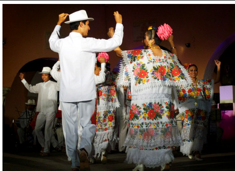
Figure 7. Traditional Bomba dancing in Yucatán.