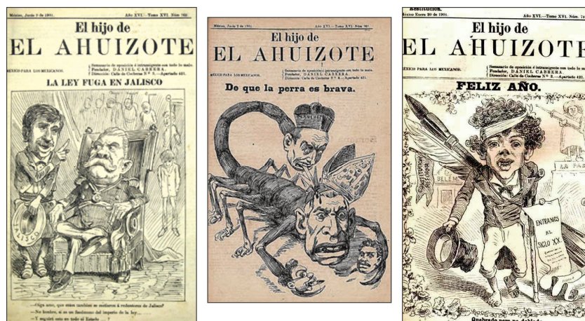
Figure 14. Albur as political satire published in El Hijo del Ahuizote , 1901.

The albur as a practice continued to evolve until the late 19 th century when the Mexican state, under the rule of Porfirio Díaz (dictator for thirty three years) decided to prohibit its practice so as not to promote self-confidence or solidarity among the population in manifesting their ideas and free expression, which could derive in dissidence.