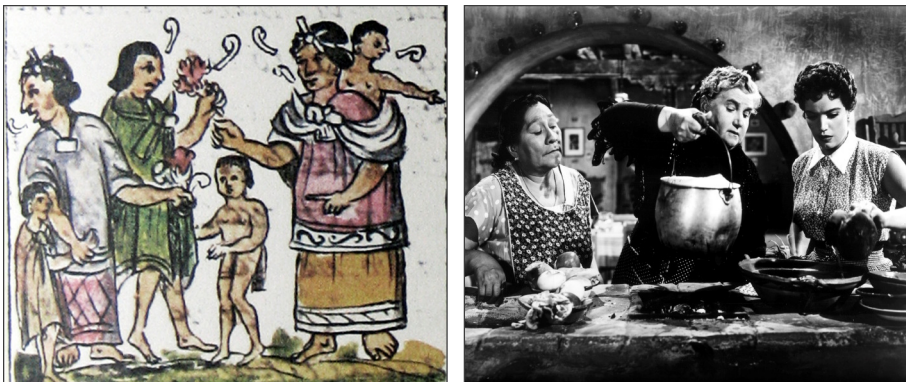
Figure 16. Wisdom being passed on within a pre-Columbian family as in the 20 th Century in the film, Los Fernández de Peralvillo , 1954.

The refrán is a poetic construction that has proliferated with the intention to transmit teachings and to promote a kind of morality based on experience. There is always a refrán for any situation, a kind of proverb dressed in a metaphorical saying decorated in metonyms. Besides the verbal folklore of Mexico, experiences, suspicions, malice and popular sharpness are reflected always with spirit and a touch of liveliness in the transmission of its teachings. Although introduced from Europe and having its origins in fables and proverbs of Hellenic times (and even further back to Mesopotamia), the refrán in Mexico has developed local characteristics and terms, giving it a particular tinge understood by Mexicans as theirs . Besides, new refranes are being created continuously. A Mexican refrán ? It is a poetic construction that has proliferated with the intention to transmit teachings and learned experiences, to inculcate a kind of morality derived from its message, often using local parole or modisms. Those idioms often are only understood locally (see Figure 16).