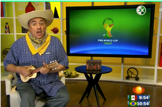
Figure 8. Víctor Trujillo as El Charro Amarillo , on television, Televisa channel, 2010.

ENTONATION: Another variant of INSINUATION proceeds even if the additional meaning added to words and themes is not common knowledge or normally understood. It is in the way the phrases are put together and the timbre of the voice used to chant the utterance that will set up that utterance as an albur , for which the other person would have to respond in a likely way. Even simple commentaries in everyday chores can be understood as an albur , a motive for mischievous humour – such as a secretary asking her boss: