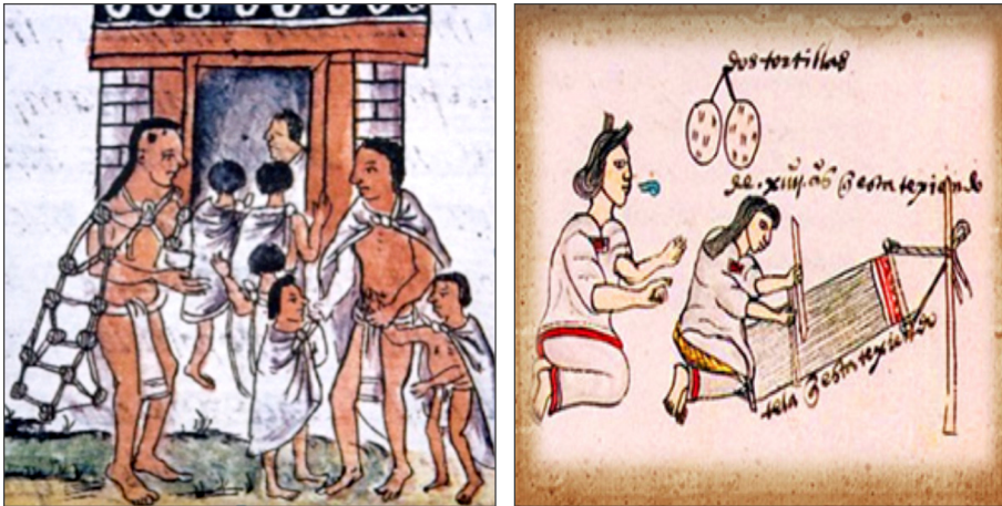
Figure 10. Aztec boys being educated at the Teocalli ; Aztec girls being trained in the art of weaving, 16 th century.

Do not walk with haste nor too slowly, because walking slowly is a sign of pomp and walking quickly gives out an aftertaste of anxiety and restlessness. You will walk straight with your head slightly bowed. 13(OT)