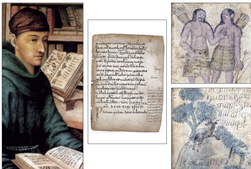
Figure 12. Portrait of Fray Bernardino de Sahagún, page from Sahagún's documentation, and Cantares Mexicanos (first book of songs in Nahuatl), 16 th century.

With the European Conquest, repression got even worse. Not only was the old order obliterated, destroyed and persecuted, but also the new one, imposed at first by the Spanish Conquistadors and then afterward by Spain's religious flanks, always brought fire and sword, plus plagues that repressed, punished and annihilated the population even further.