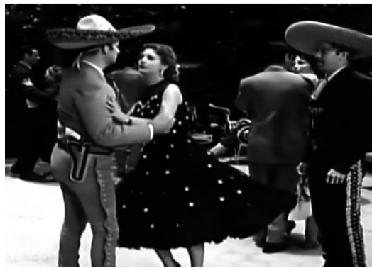
Figure 5. Pedro Infante and Jorge Negrete duel singing in Dos Tipos de Cuidado , 1953

In our research into the albur , we have come to notice different albur styles or modalities for which we have established a typology, which dissects and better explains them. Thus, the albur as a game of words employs mainly four verbal modalities: ASSOCIATION (metonymy), DECONSTRUCTION (of innocuous words), RHYME and INSINUATION. This last modalito further derives in three sub-modes: ANTICIPATION – predicting the 'obscene' word without actually saying it; ENTONATION of phrase utterance and timbre of voice; and DISGUISE – as a refrán .