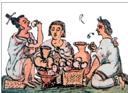
Figure 11. Nahuas in merriment, 16 th century

Thus, these expressive synthesis– fusion of words, gesture, vocal effects, colors and aromas of a musical-dancistic moment were the optimal medium for expressing indigenous eroticism. Hernández coincides in considering the cuecuechcuicatl as the pre-Hispanic antecedent of the Mexican albur , while he defines it as the “song of tickling”, also the “song that annoys or incites,” in accord with Duran's 16 th century denomination of cuecuechcuicatl as canto/baile cosquilloso o de comezón 15 — meaning “song/dance of tickles or itching” rather than canto travieso , preferred by Johansson. Shrouded in the nuances of the sensual metaphors of the Nahuatl language, the cuecuechcuicatl functioned as an escape valve for the pervading strict rules within pre-Columbian society (see Figure 11).