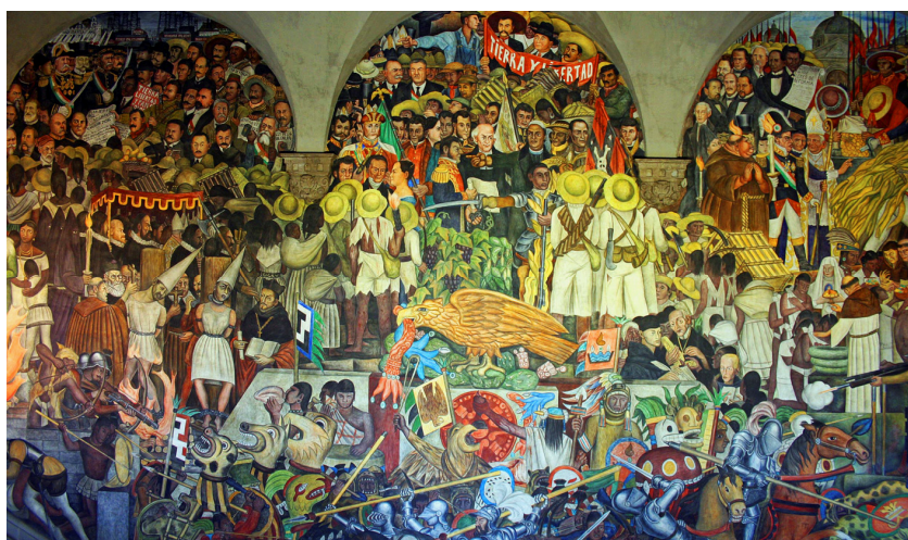
Figure 2. Diego Rivera Mural at the National Palace of Mexico

It is obviously visible in art, as much in the works of Mexico's grand masters – such as the famous muralists and other painters of the 20 th century– as in the popular arts, where colors, strong vibrant and contrasting, are emblematic (see Figure 2).