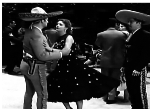
Figure 5. Pedro Infante and Jorge Negrete duel singing in Dos Tipos de Cuidado , 1953

In our research into the albur , we have come to notice different albur styles or modalities for which we have established a typology, which dissects and better explains them. Thus, the albur as a game of words employs mainly four verbal modalities: ASSOCIATION (metonymy), DECONSTRUCTION (of innocuous words), RHYME and INSINUATION. This last modalito further derives in three sub-modes: ANTICIPATION – predicting the 'obscene' word without actually saying it; ENTONATION of phrase utterance and timbre of voice; and DISGUISE – as a refrán .