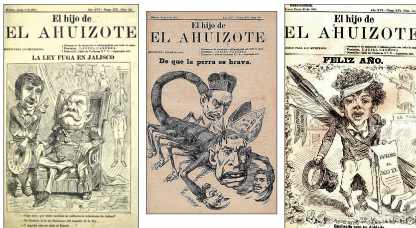
Figure 14. Albur as political satire published in El Hijo del Ahuizote , 1901.

The albur as a practice continued to evolve until the late 19 th century when the Mexican state, under the rule of Porfirio Diaz (dictator for thirty three years) decided to prohibit its practice so as not to promote self-confidence or solidarity among the population in manifesting their ideas and free expression, which could derive in dissidence.