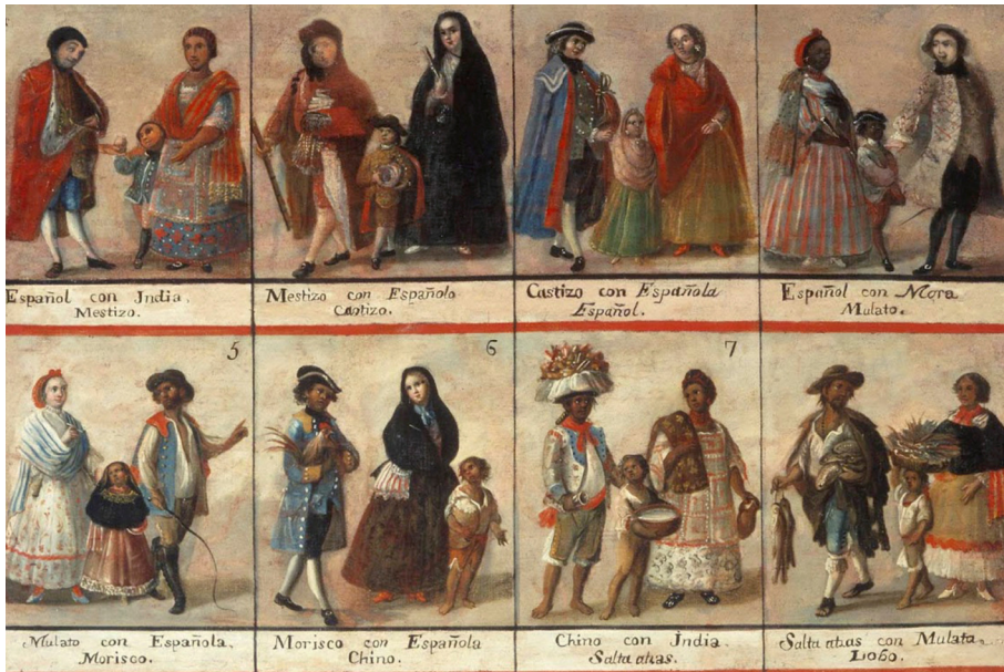
Figure 13. Pintura de Castas depicting mestizaje , 17 th century.

The albur as a practice continued to evolve until the late 19 th century when the Mexican state, under the rule of Porfirio Diaz (dictator for thirty three years) decided to prohibit its practice so as not to promote self-confidence or solidarity among the population in manifesting their ideas and free expression, which could derive in dissidence.