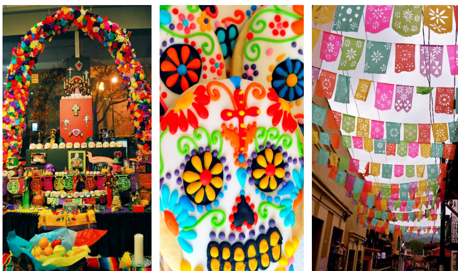
Figure 3. Altar and sweets for Days of the Dead and a village street during festivities

village, town or city neighborhood when religious, civic, or individual celebrations occur (see Figure 3).