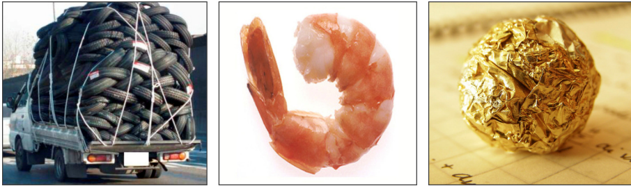
Figure 15. Everything fits, the carried-away shrimp, and false gold

The refrán is a poetic construction that has proliferated with the intention to transmit teachings and to promote a kind of morality based on experience. There is always a refrán for any situation, a kind of proverb dressed in a metaphorical saying decorated in metonyms. Besides the verbal folklore of Mexico, experiences, suspicions, malice and popular sharpness are reflected always with spirit and a touch of liveliness in the transmission of its teachings. Although introduced from Europe and having its origins in fables and proverbs of Hellenic times (and even further back to Mesopotamia), the refrán in Mexico has developed local characteristics and terms, giving it a particular tinge understood by Mexicans as theirs . Besides, new refranes are being created continuously. A Mexican refrán ? It is a poetic construction that has proliferated with the intention to transmit teachings and learned experiences, to inculcate a kind of morality derived from its message, often using local parole or modisms. Those idioms often are only understood locally (see Figure 16).