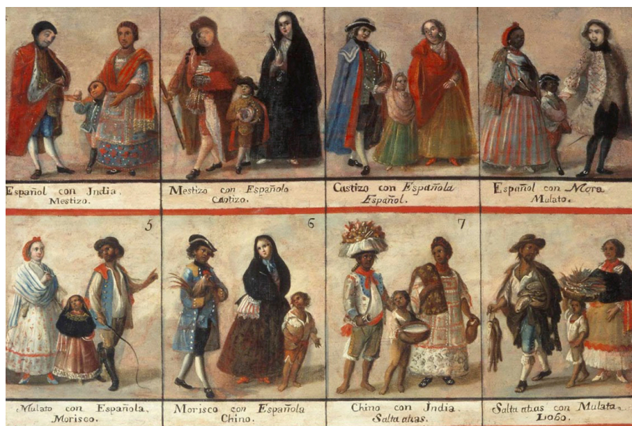
Figure 13. Pintura de Castas depicting mestizaje , 17 th century.

The albur as a practice continued to evolve until the late 19 th century when the Mexican state, under the rule of Porfirio Díaz (dictator for thirty three years) decided to prohibit its practice so as not to promote self-confidence or solidarity among the population in manifesting their ideas and free expression, which could derive in dissidence.