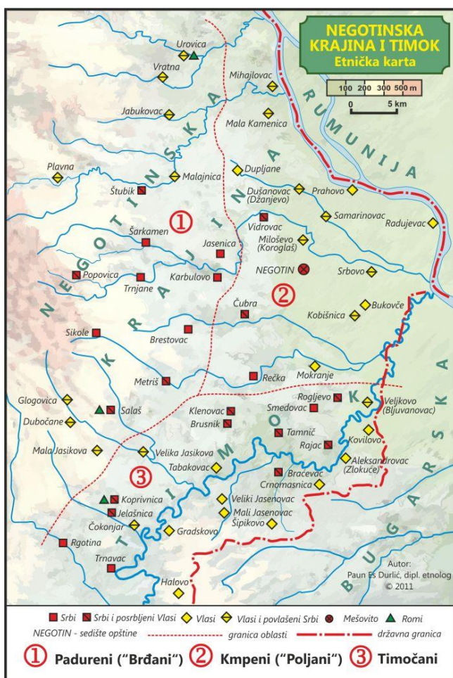
Figure 3. Detailed interactive map of the Negotinska krajina and Timok regions ( http://www.paundurlic.com/vlaski.recnik/mapa-timoceni.php )

The author categorizes the Vlachs, according to the geographical areas of North-Eastern Serbia they inhabit, into three main groups: 1) Eastern, 2) Central and 3) Western Vlachs. The linguistic groups presented on the map are: Ungureni ( Bănăţeni ) Vlachs, Muntenei ( Bănăţeni ) Vlachs, Ţărani ( Oltenei ) Vlachs, Bufani Vlachs, Bayash (Romanian speaking Roma) and Serbs. By clicking on one of the 17 sub-regions on the map, one gets more detailed micro-maps, with further categorizations of the Vlachs (as we can see from Figure 3 – Pădureni , Câmpeni , Timoceni , for example, in the Negotinska krajina and Timok regions), a complete network of settlements, and the possibility to click on them and to visualize the entire lexicographic material collected there or connected with that particular place (see Figure 4).