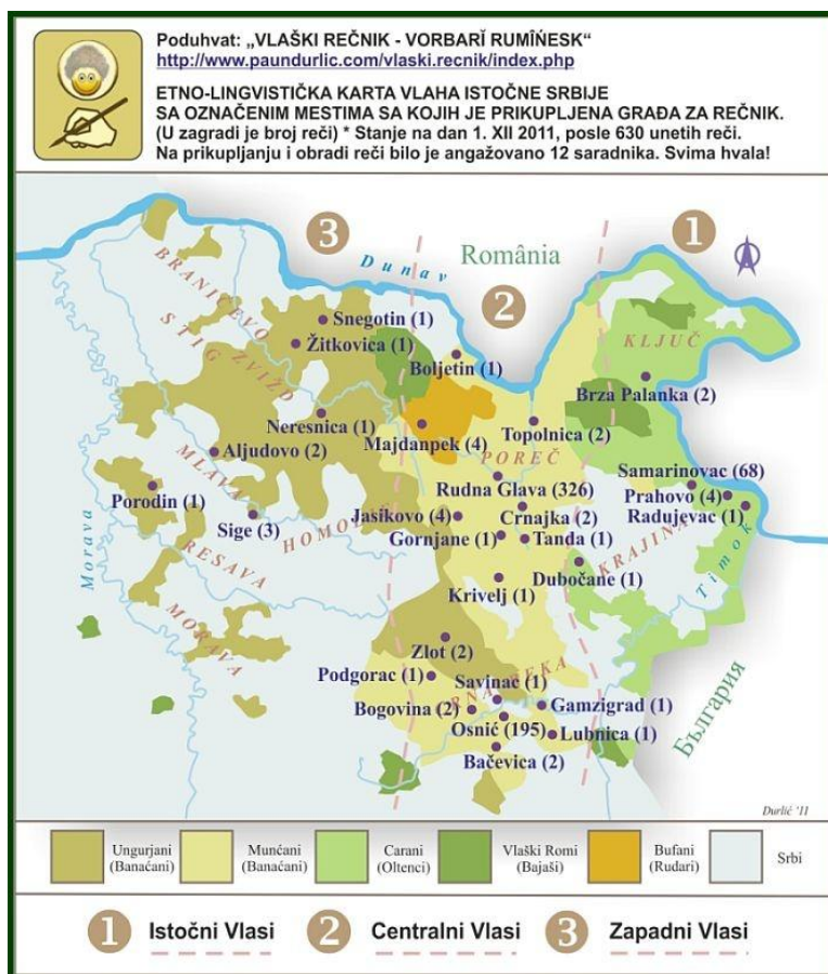
Figure 6. Ethnolinguistic map of the Vlachs of North-Eastern Serbia, presenting the situation of VOD on December 1st 2011, after 630 compiled entries ( http://www.paundurlic.com/forum.vlasi.srbije/index.php?topic=1146.0 )

Figure 6 presents the ethnolinguistic map of North-Eastern Serbia with the localities where the language material for VOD was collected, and it reflects the exact situation on December 1 st 2011. The figure in brackets, following the name of the locality, indicates the number of words collected in that particular place.