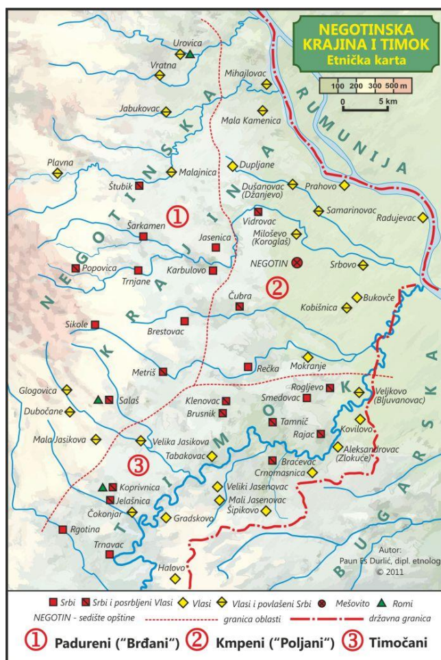
Figure 3. Detailed interactive map of the Negotinska krajina and Timok regions ( http://www.paundurlic.com/vlaski.recnik/mapa-timoceni.php )

The author categorizes the Vlachs, according to the geographical areas of North-Eastern Serbia they inhabit, into three main groups: 1) Eastern, 2) Central and 3) Western Vlachs. The linguistic groups presented on the map are: Ungureni ( Bănăţeni ) Vlachs, Muntenei ( Bănăţeni ) Vlachs, Ţărani ( Oltenei ) Vlachs, Bufani Vlachs, Bayash (Romanian speaking Roma) and Serbs. By clicking on one of the 17 sub-regions on the map, one gets more detailed micro-maps, with further categorizations of the Vlachs (as we can see from Figure 3 – Pădureni , Câmpeni , Timoceni , for example, in the Negotinska krajina and Timok regions), a complete network of settlements, and the possibility to click on them and to visualize the entire lexicographic material collected there or connected with that particular place (see Figure 4).