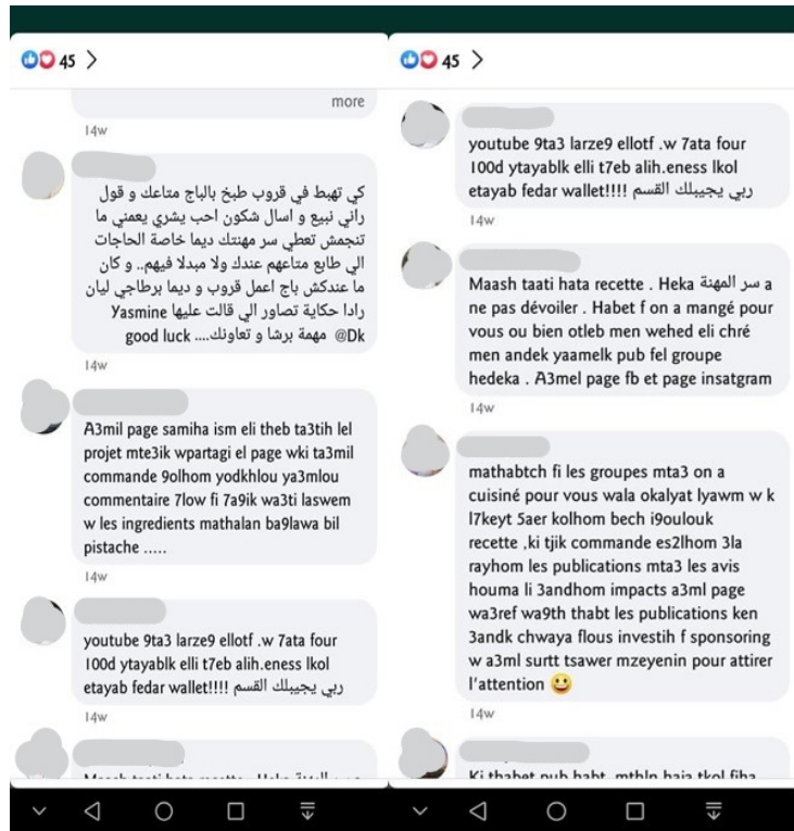
Figure 2. Screenshots taken from Facebook, retrieved on 5th of September 2020

According to Gervasio and Karuri (2019), when people occupy online platforms, they reconstruct language in ways that match the constraints and affordances of different digital spaces. Users of social media take photos and upload them or share status updates in real time and space, rendering the process a naturalized practice. This being the case, observing Facebook Stories, similar features were found. Taking the example of G.R. who, in a time slot of two hours, posted seven stories (see figure 3). From the seven stories, three were in English, one in Tunisian Arabic, one in Modern Standard Arabic, one in Egyptian Arabic, and one in French and Tunisian Arabic. These mixtures of languages and more are usually found in Tunisians' Facebook or Instagram Stories. The variation in language usage and graphics is also strongly present. When browsing through many stories, we note that, apart from other languages, variants of the Arabic language are also present. People tend to self-express in the social media while spontaneously displaying their linguistic identities in real time and space.