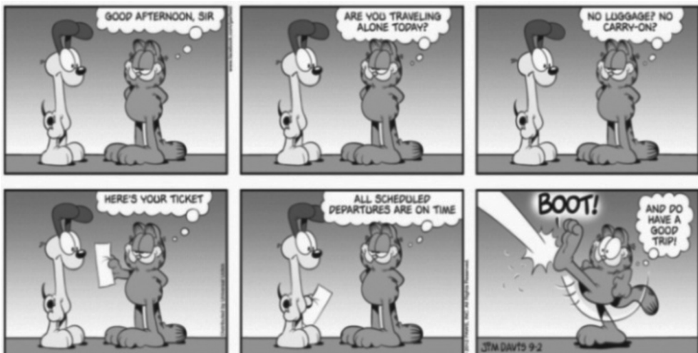
Figure 1. Cartoon captions