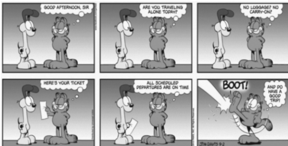
Figure 1. Cartoon captions