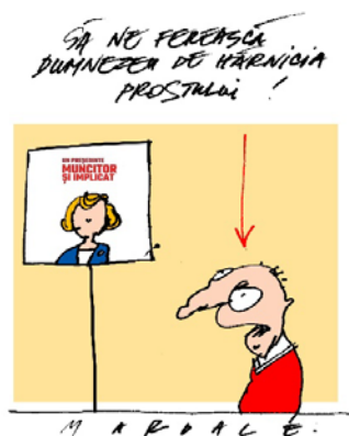
Figure 1. Poster in catavincii.ro

During 2019's runoff presidential electoral campaign, most of the attention went on former prime-minister Viorica Dăncilă, who ran for president along chief of state Klaus Iohannis. During her prime-minister mandate, she did many grammar mistakes or inappropriate gestures during official visits or press conferences, therefore she was characterized as unexperienced or even silly by many people, particularly Internet users. She then became the target of many bad jokes highlighting how Romania will be ruined if she will ever be elected. Viorica Dăncilă entered the Romanian political scene quite suddenly, in 2018, when she was proposed as prime-minister by the Social Democratic Party, becoming the first Romanian women to ever have such position. From the very beginning, Dăncilă got the attention of both national and international media due to her bad grammar, which turned her into satirists and caricaturists' source and target of humour.