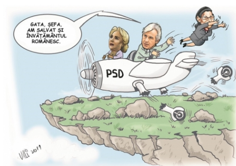
Figure 6. Cartoon in academiakatavencu.ro

In Figures 3, 4 and 5 , the satirists have taken the picture with the former prime-minister's face and pasted it on three different images and three different contexts to highlight her lack of experience for the position she held, by pasting her face on top of pictures representing contexts she would better fit in: Photoshop activities, crossword puzzles or Disneyland. All these memes have emerged during the 2019