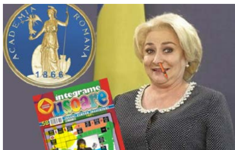
Figure 4. Meme in timesnewroman.ro