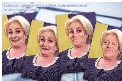
Figure 3. Meme in timesnewroman.ro

Another important difference between classic cartoons and memes is the decontextualization - recontextualization process. As mentioned above, memes are the result of two or three images, overlapped, in order to create a meaning. This process of taking a picture from one place and paste it on top of another picture involves decontextualization - cutting a picture from its initial context - and recontextualization - paste it into another context, usually, when talking about humor, a totally different one. I found this process extremely important for the creation of humor in memes, as usually these exact opposed contexts are the ones to create humor through following the script opposition.