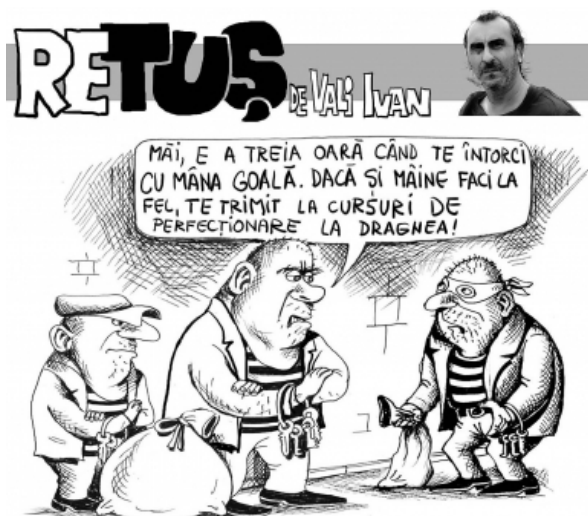
Figure 8. Cartoon in academiakatavencu.ro

Political cartoons, instead, come up with dialogues, normally in balloons. This method is very old and has become a symbol of cartoons during time. Just like balloons, captions are used by satirical journalists to guide their readers towards their intended message. Both balloons and captions help the reader identify the characters, if they are not so recognizable, the political or social event they are targeting, or simply their perspective on it. This is also because memes use real photos of the targets/politicians, but cartoons work with what the cartoonists are creating, thus, the chances for their characters to be unrecognizable and the message to be confusing is bigger.