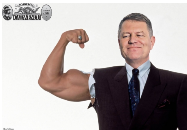
Figure 7. Meme in academiacatavencu.ro

As mentioned in the beginning of this article, most of the memes are used in satirical news along with a full text/satirical news, while political cartoons can carry a strong message per se , with small texts in captions or balloons. Political cartoons, as most of the times are addressing complex political or social-political facts, must give the reader some extra information, this way making sure the message will be correctly interpreted, thus, the humour will be effective. Hence, in memes, texts are not inserted in the image, because the image is just a part of the whole news , meanwhile cartoons are the actual news , with some extra information in balloons or captions.