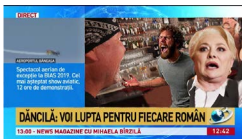
Figure 2. Meme in timesnewroman.ro