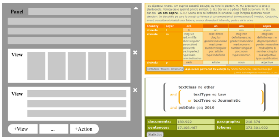
Fig. 4. “Panels”, “Views” and “Actions” as elements of the KorAP user interface.

The user interface of KorAP is divided into several sections (called “panels”), which contain various functional information (see Fig. 4). Currently, panels are available for the following functional areas: a) the creation of the query, b) the display of the search result, c) the creation of the query. In the future, further functional areas are expected to be implemented as panels. These panels allow to provide “actions” (such as switching the text direction from left to right in the result area) and to embed several “views” (i.e. extras on demand ) into the corresponding panels to provide additional information for the respective area (such as showing statistical information about the virtual corpus, showing annotations about a match, or showing the underlying API response for results). This structure was introduced to ensure a high degree of extensibility to new functions without changing the overall appearance of the interface. It is also the basic structure for plugins (see Section 3). The panel-based layout has been designed to be suitable for different screen resolutions, although we assume that most complex tasks are still performed on desktop or laptop computers (as suggested by an early user tracking study in the KorAP instance of DeReKo).