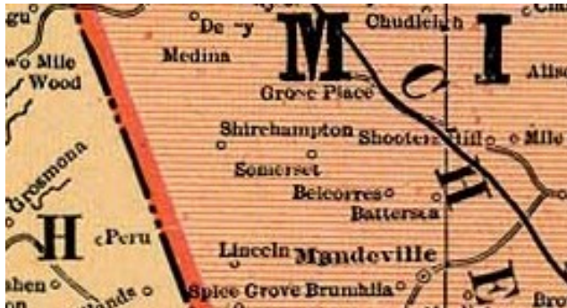
Figure 5: Excerpt from a map of 1901 by George F. Cram, Chicago