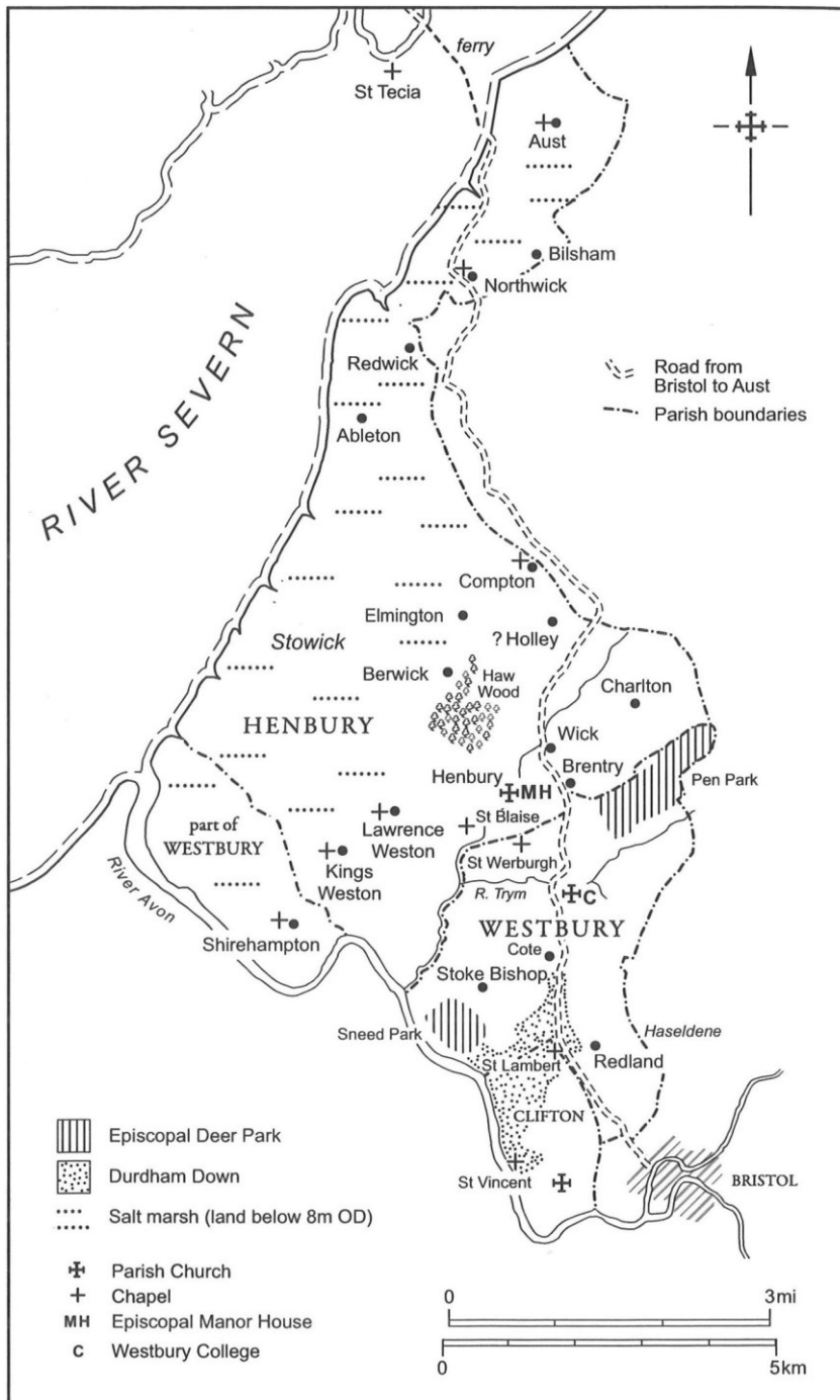
Figure 2: James Russell's map (in Orme & Cannon 2010) showing Shirehampton tithing in the wider context of Westbury and Henbury parishes.

also in Henbury hundred. The question of Shirehampton's detachment deserves further investigation, but this is not the place to do it.