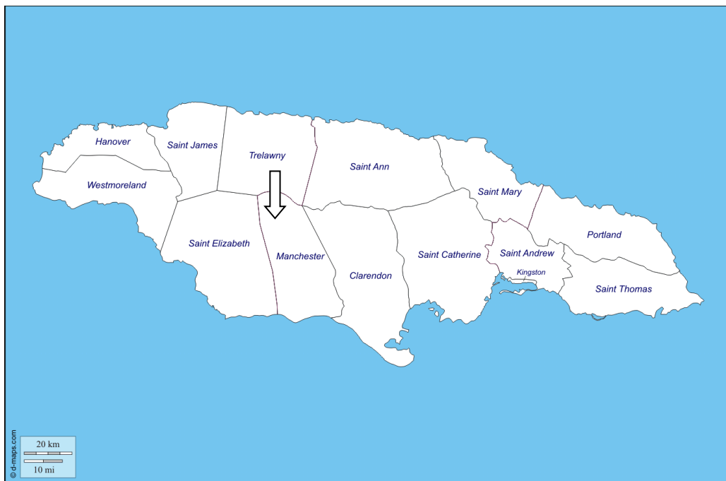
Figure 6: The parish structure of Jamaica, with the approximate location of Shirehampton marked by the arrow ( d-maps.com/pays.php?num_pay=147&lang=en ).