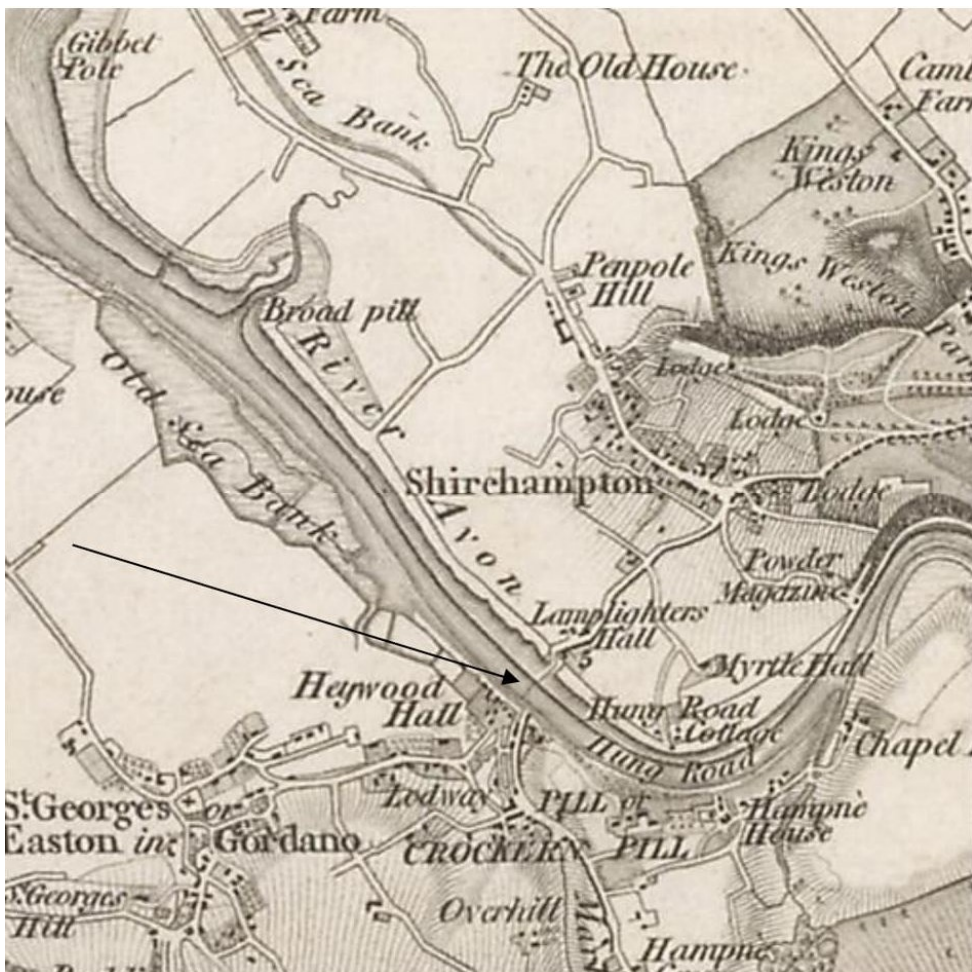
Figure 1: Map of Shirehampton in 1830 (Ordnance Survey), with the ferry to Pill arrowed

name or names featuring in the record, and some real-world consequences of that. All that may sound hyperacademic, pedantic and abstract, perhaps even mysterious, but the article itself is much concerned with the hard detail of the transmitted documentary record, and the intention is, as far as the evidence permits, to clarify what has often been obscure about the name(s) of this place. A. H. Smith took a mere seven lines of print to give an etymology for the dominant name-form set of Shirehampton (PN GI III: 132), one line of which is the heading and five the data, but without even addressing the current form of the name. 2 To get somewhere near exhausting what I think needs to be said, deserves to be said, and is revealing and entertaining about the local relation between language, geography, history and culture will take 36 pages of this journal.