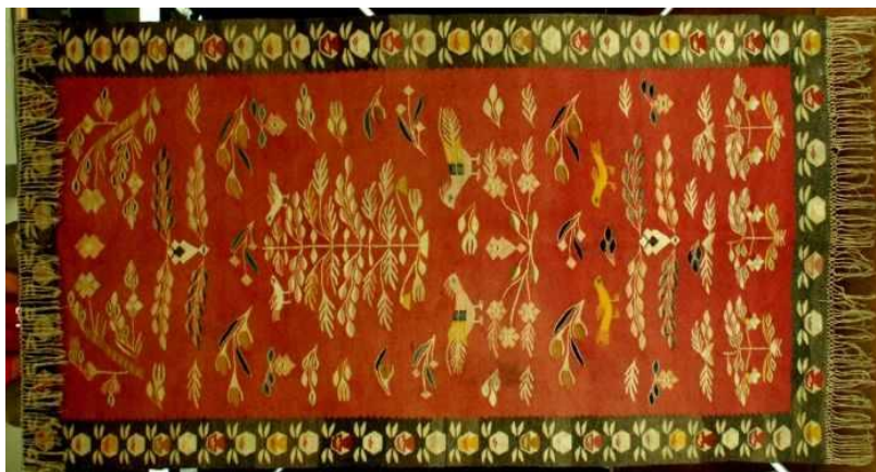
Fig. 3. Oltenia's carpet with Life Tree and The Symbolical Heaven's Garden