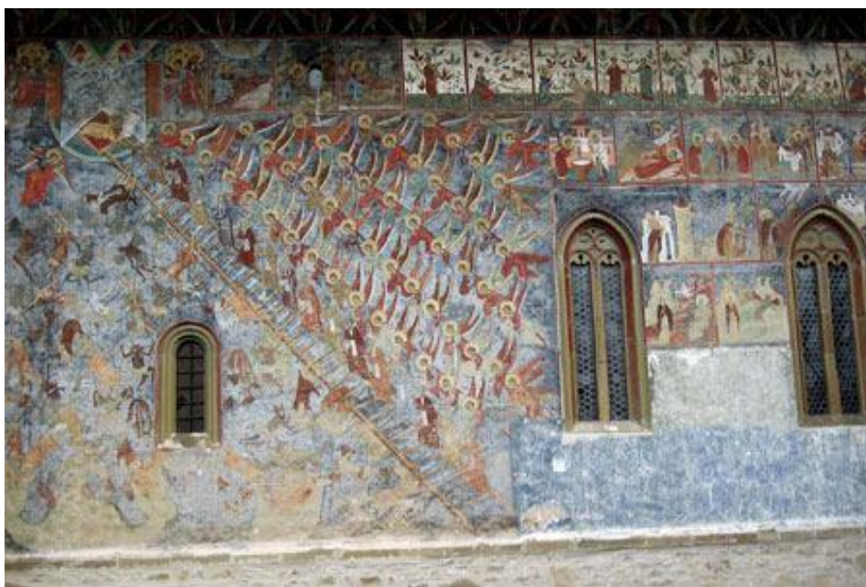
Fig. 1. The angels' stairs, Sucevița