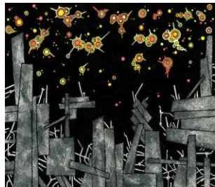
Matt Kish – Tekla

'We will show it to you as soon as the working day is over; we cannot interrupt our work now,' they answer. Work stops at sunset. Darkness falls over the building site. The sky is filled with stars. 'There is the blueprint', they say." ( ibidem , 112)