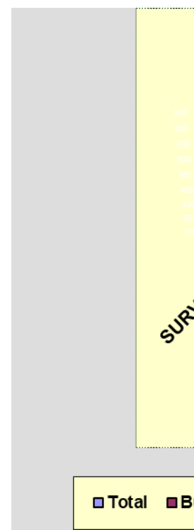
Figure 1 Comparative statistics of buyers number in the two author's surveys