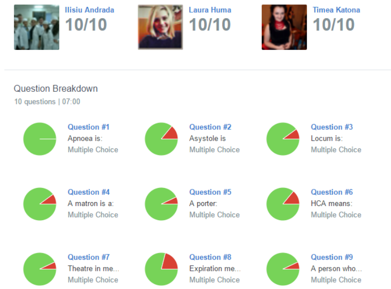
Fig. 3 Overall quiz results with question breakdown

Students' overall quiz performance is depicted as highest scores and in the form of pie charts with question breakdown (Fig. 3).