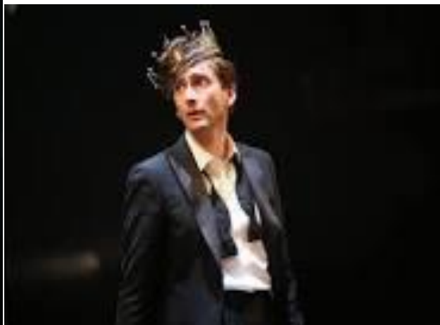
Figure 10: playful Hamlet