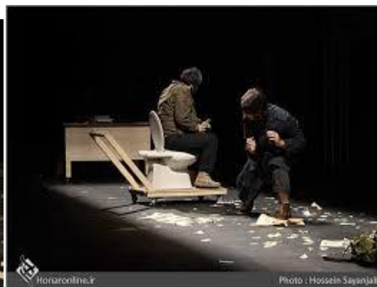
Figure 5: a portable toilet with lighting to enhance the soldier's miserable situation

The audience is spelled with the presence of past on the stage as the classical characters bind the magic of Shakespeare’s story with the modernization of the contemporary director.