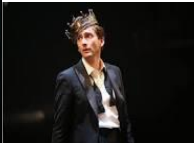
Figure 10: playful Hamlet