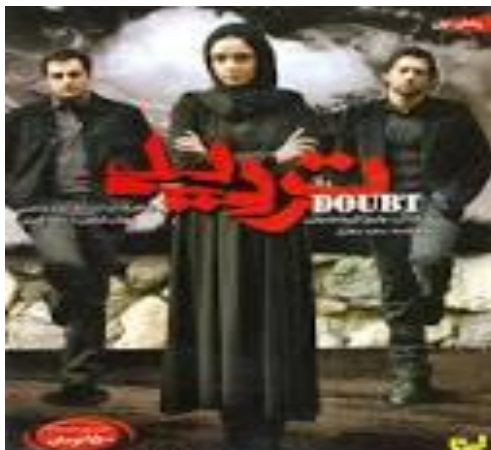
Filmic Text: Tardid

addresses the fact that Hamlet's personality resembles more his uncle than his father although their appearances as brothers are extremely alike.