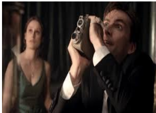
Figure 6: Hamlet with Super 8 camera

single-camera technique is especially preferred by the director if specific camera angles and camera movements are deemed crucial to the success of the production. This technique allows the director to present fast-paced actions which are normally contradictory to his hesitation and state of inaction. The filming method which Nelson explains is “more typical of television (cutting between mid-shots and occasionally moving in close) to capture the nuances of the performances and the play’s theme of madness” which is directly following the hypotext whereas Dadgar’s Hamlet is less affiliated with this theme.