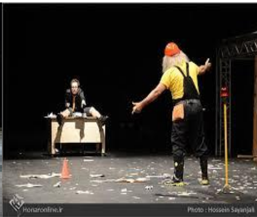
Figure 3: Hamlet's desk and some lights