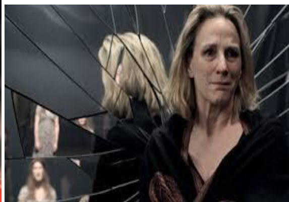
Figure 8: Mirrors shattered

However, the televisual text has some scenes performed outside a theater stage and in that closely resembles a cinematic text. BBC version of Hamlet is considered to be categorized as medial transposition when Shakespeare’s Hamlet is transmitted from a verbal text into a performative one exclusively to broadcast on television. This is different