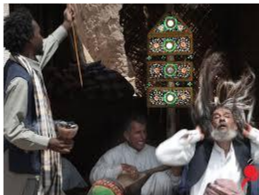
Figure 11: Khalipheh in Guwati ritual to exorcise the father's ghost

As a fictional film which tells a fictional story or a narrative, Tardid tries to convince the audience that the unfolding fiction is real through various believable characters, narratives, mise-en-scène, camera movement, sound, and lighting. To maintain a sense of realism, great detail is included in the screenplay, which avoids from deviating from the predetermined behaviors of a classical screenplay as opposed to the behavior of documentaries or experimental films. As a mode of classical form, Tardid imitates human perception. According to Deleuze “classical cinema stabilizes the image flux by creating logical connections and associations, logic driven by narrative structure” (qtd. in Harbord, 2007, 25). Siavash, Mahtab, Garu, Khosro and MahTal'at are all depicted as believable characters who are engaged in a network of a murder and revenge story. To enhance this sense of reality, Siavash is informed not by his father's ghost roaming about, but in his dreams and then by Khalipheh who is somehow connected to the supernatural world. The events are logically presented and set of shots do not leave the audience in an ambiguity. The boundary between the imaginary and the real is clearly intact. The structure of the film, as a game of various components to be fitted together, replays the relation between indecision and strictly bounded narrative.