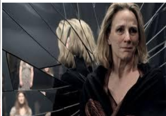
Figure 8: Mirrors shattered

However, the televisual text has some scenes performed outside a theater stage and in that closely resembles a cinematic text. BBC version of Hamlet is considered to be categorized as medial transposition when Shakespeare’s Hamlet is transmitted from a verbal text into a performative one exclusively to broadcast on television. This is different