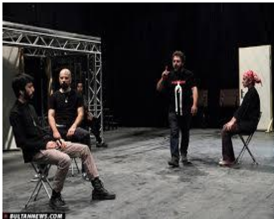
Figure 2: only 3 chairs on the stage

stage. This contradiction results in a ‘synthesis’ between past and present practice. Taking this into consideration, we can assume that Elizabethan theatre and twenty-first-century theatre could be regarded as different media, since their codes and conventions are of similar nature but belong to different cultural landscapes; thus Dadgar’s diachronic mise-en-scène in his adaptation would also be intermedial.