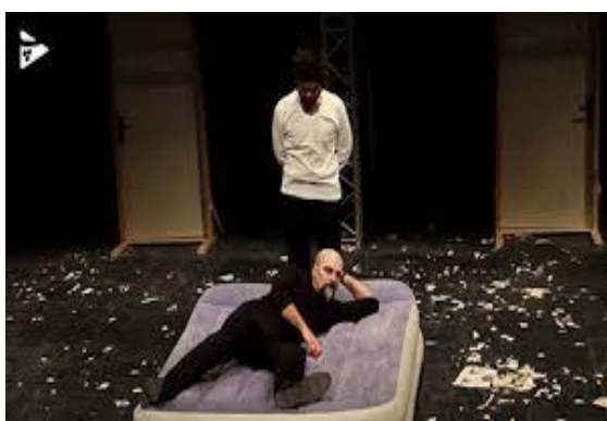
Figure 4: a mattress to represent swimming pool