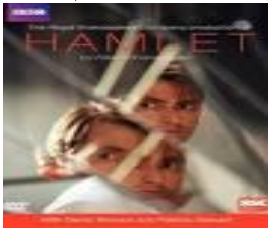
Figure 7: mirrors shattered

Elizabeth Klaver (2000) is right when she describes how a film incorporates other media such as a play or a painting, explaining that “the other media have to be first translated into electronic beams of light before they can be visually represented. For this reason, film and television appear to absorb other media more completely into their performative grounds” (93-94). Doran’s Hamlet was set in “the glossy black mirror-like floor and the huge full-height mirrors at the back of the stage, which shattered dramatically when Polonius was shot” (cited in RSC website).