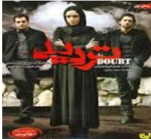
Filmic Text: Tardid

addresses the fact that Hamlet's personality resembles more his uncle than his father although their appearances as brothers are extremely alike.