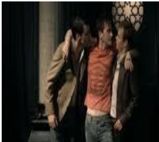
Figure 9: Modern Hamlet in a T-shirt

David Tenant, who stars as Hamlet, is not like Shakespeare's Hamlet dressed in 17 th -century costumes, or in ragged shorts of Dadgar's Hamlet, but in a T-shirt and parka, representing a modern man in the modern world. His refreshing humor and sarcasm seems to befitting the indecisive yet philosophical persona. His displays of what Harold Bloom has called a "proleptic imagination" is repetitively shown in his language while using various metaphoric references. "This is a Hamlet of quicksilver intelligence, mimetic vigour and wild humour," wrote Billington: "one of the funniest I've ever seen." Tenant gives the audience an insight to the character's multiple personalities with his temperamental mood swings, his mad capriciousness and his playful revenge-plan.